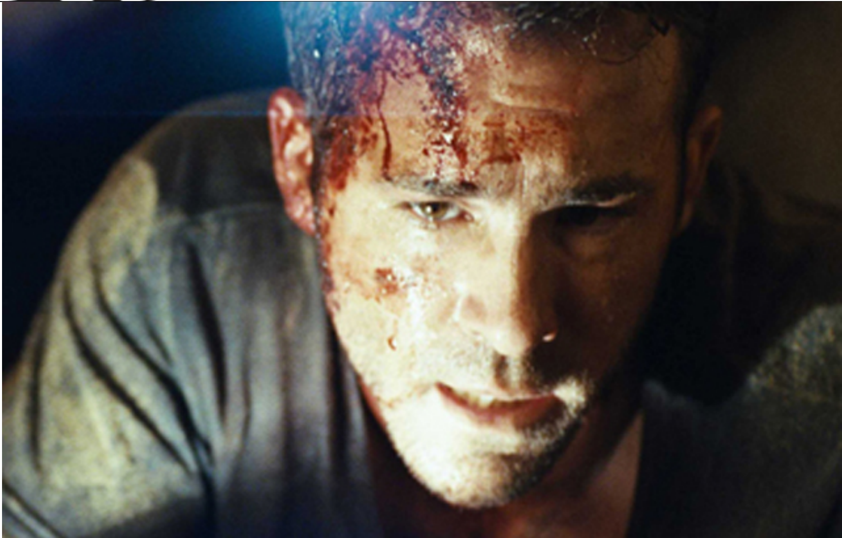
Land Down Under: Ryan Reynolds as Paul Conroy in ‘Buried’

★ Continue reading for Patrick McDonald’s full review of “Buried” [15]