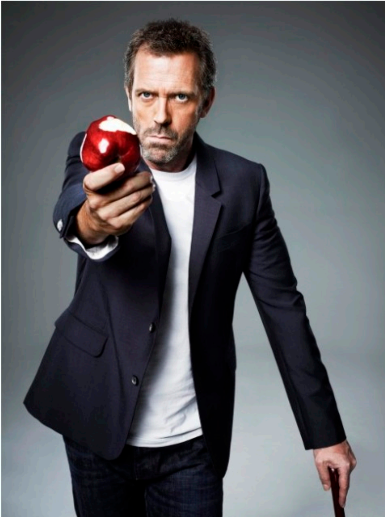
Hugh Laurie returns as Dr. Gregory House in the seventh season of HOUSE premiering Monday, Sept. 20 (8:00-9:00 PM ET/PT) on FOX.

It would have been remarkably ambitious (although probably a bit frustrating to some fans of the show) if the premiere of "House" had taken place entirely in the doctor's apartment, but the doctor's decision to take the day off has repercussions back at the office. Hospitals need to have a licensed neurosurgeon on staff or be forced to shut down their emergency room and even transfer the stable ICU patients to a building with a full staff. When the powers that be learn that there's no surgeon in the building, Chase (Jesse Spencer), Taub (Peter Jacobson), Foreman (Omar Epps), and Thirteen (Olivia Wilde) scramble to fill the position and stumble across a doctor in the middle of his own medical crisis.