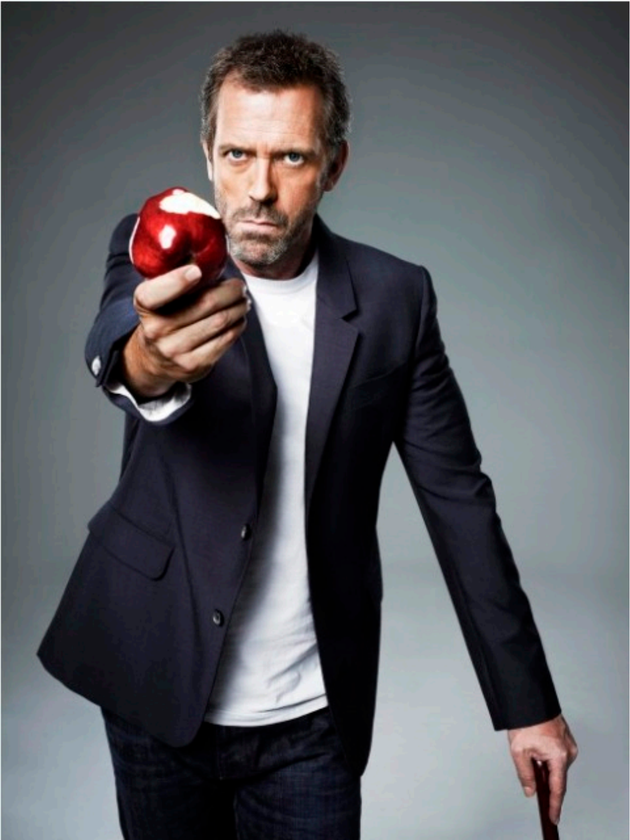
Hugh Laurie returns as Dr. Gregory House in the seventh season of HOUSE premiering Monday, Sept. 20 (8:00-9:00 PM ET/PT) on FOX.

It would have been remarkably ambitious (although probably a bit frustrating to some fans of the show) if the premiere of “House” had taken place entirely in the doctor’s apartment, but the doctor’s decision to take the day off has repercussions back at the office. Hospitals need to have a licensed neurosurgeon on staff or be forced to shut down their emergency room and even transfer the stable ICU patients to a building with a full staff. When the powers that be learn that there’s no surgeon in the building, Chase (Jesse Spencer), Taub (Peter Jacobson), Foreman (Omar Epps), and Thirteen (Olivia Wilde) scramble to fill the position and stumble across a doctor in the middle of his own medical crisis.