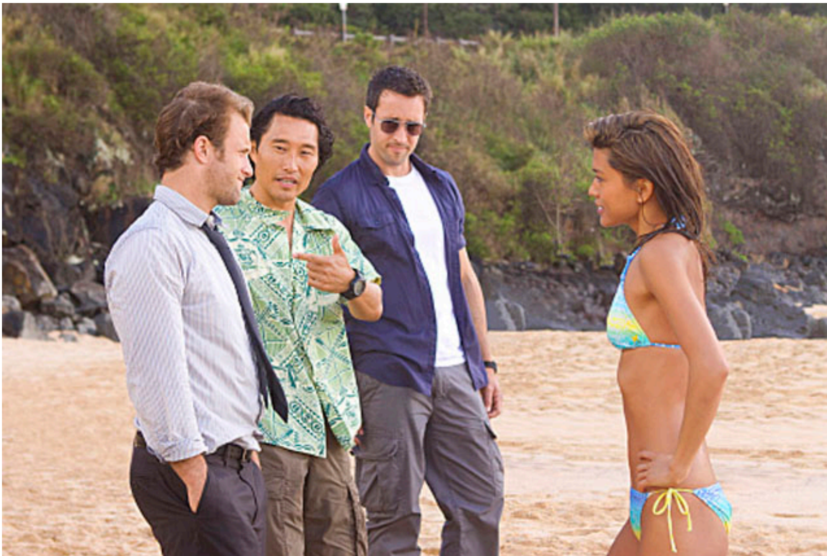
Scott Caan (Danno), Daniel Dae Kim (Chin Ho), Alex O'Loughlin (McGarrett) and Grace Park (Kona) in 'Hawaii Five-0'

McGarrett puts together the team – a native Hawaiian ex-cop named Chin Ho Kelly (Daniel Dae Kim), who worked with his father, Kelly's cousin Kona Kalakaua (Grace Park), a fresh recruit from the police academy, and of course Danno, whose unconventionality clashes with the straitlaced military man Steve McGarrett.