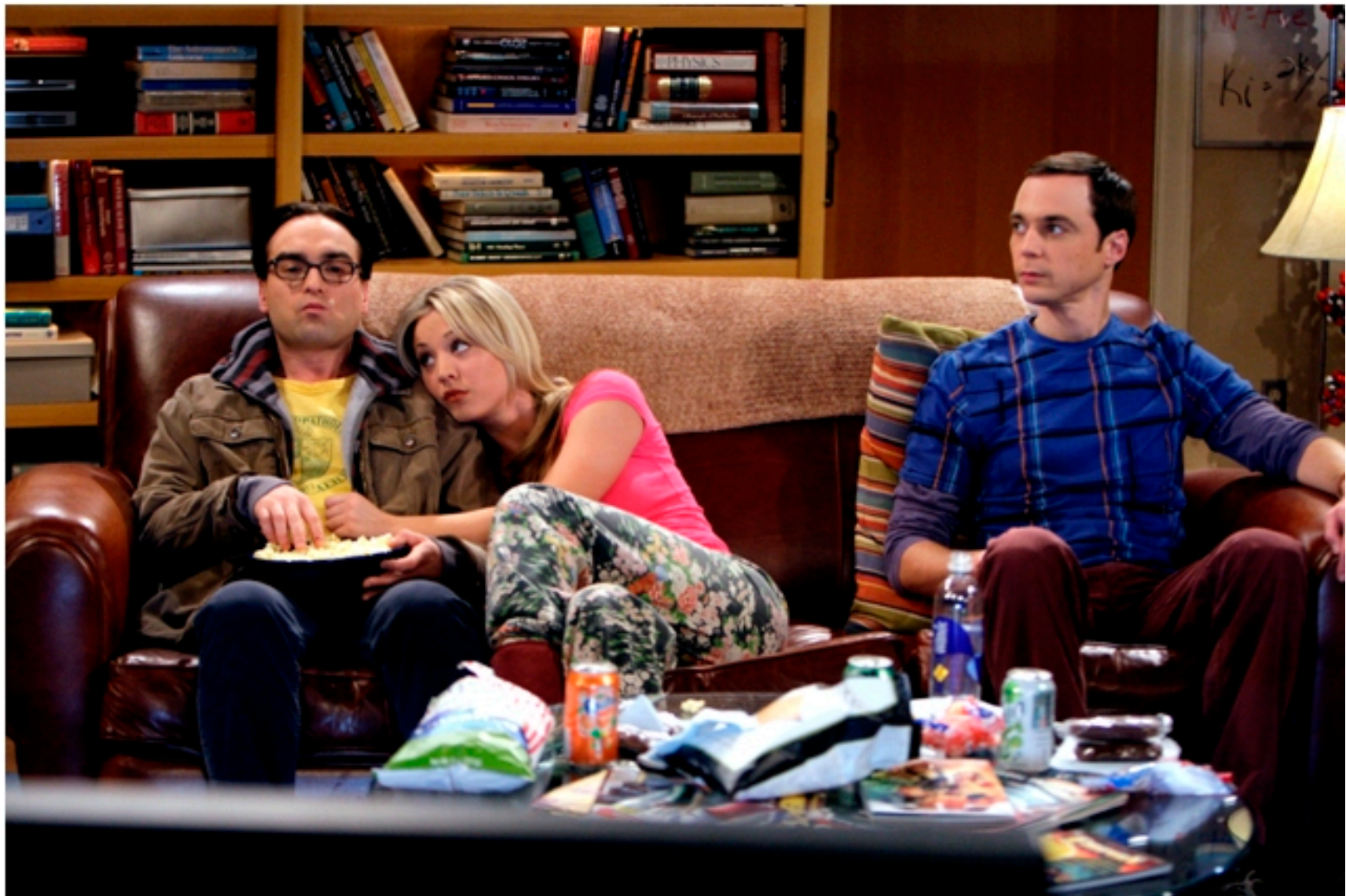
The Big Bang Theory: The Complete Third Season was released on Blu-ray and DVD on September 14th, 2010.

The great thing about “The Big Bang Theory” is how much creator Chuck Lorre has expanded upon his original concept. At first, the show was essentially just about two dorky guys, their two even-dorkier friends, and the sexy girl who lives across the hall. While the cast has been good from day one, the set-up seemed a bit generic and the writing sometimes came off as clichéd.