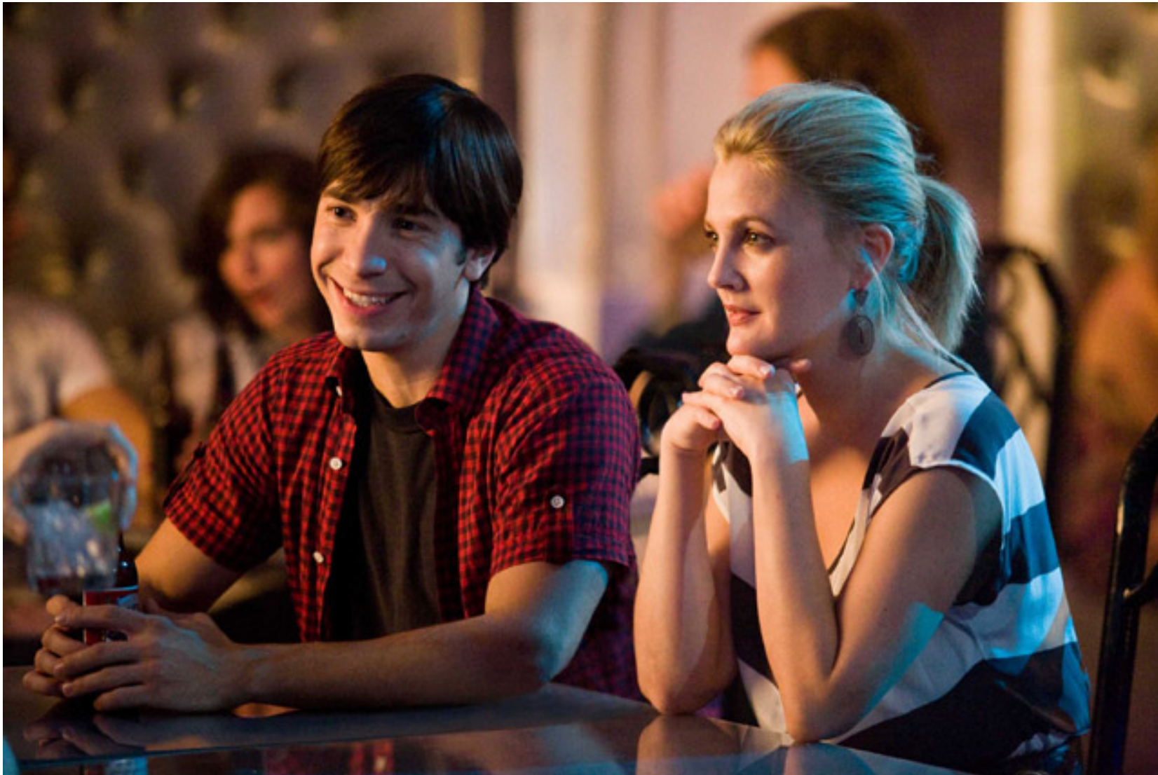
Frequent Flyer Couple: Justin Long as Garrett and Drew Barrymore as Erin in 'Going the Distance'