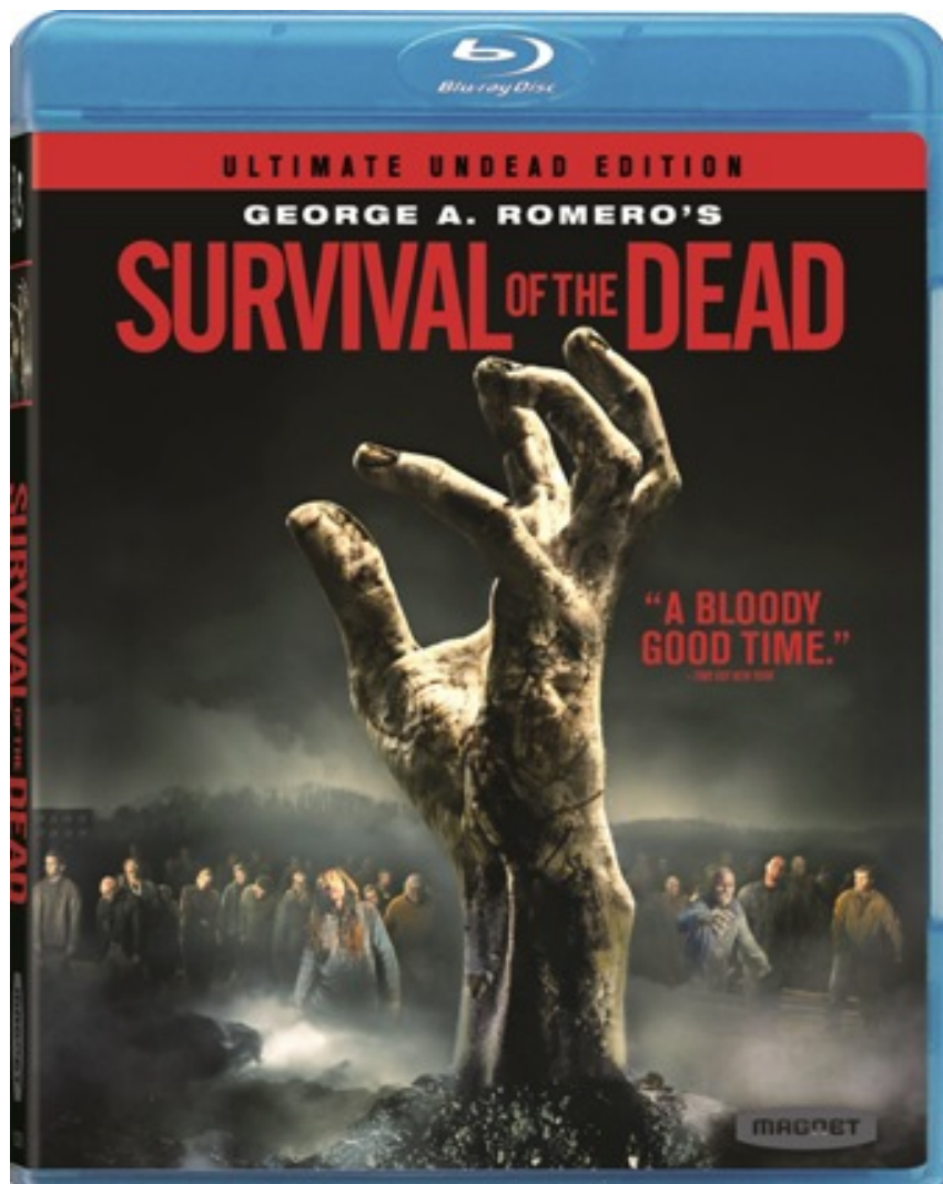
George A. Romero's Survival of the Dead was released on Blu-ray and DVD on August 24th, 2010