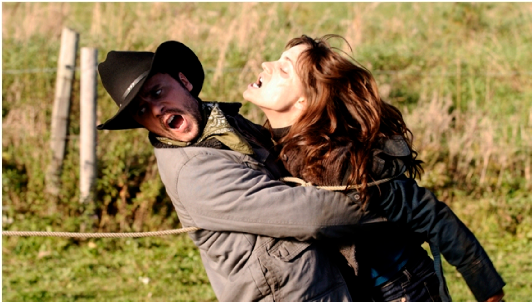
George A. Romero’s Survival of the Dead was released on Blu-ray and DVD on August 24th, 2010

For one of the few times in Romero’s amazing career, it feels like he’s spinning his wheels. “Survival” is half-baked and poorly-constructed, a serious step down from “Diary of the Dead” and “Land of the Dead”. Despite a few well-made action scenes, the sixth “Dead” film feels more like the work of a director inspired by Romero than something made by the master himself. It’s a zombie version of what he does so well — feeding off what came before and not quite all there.