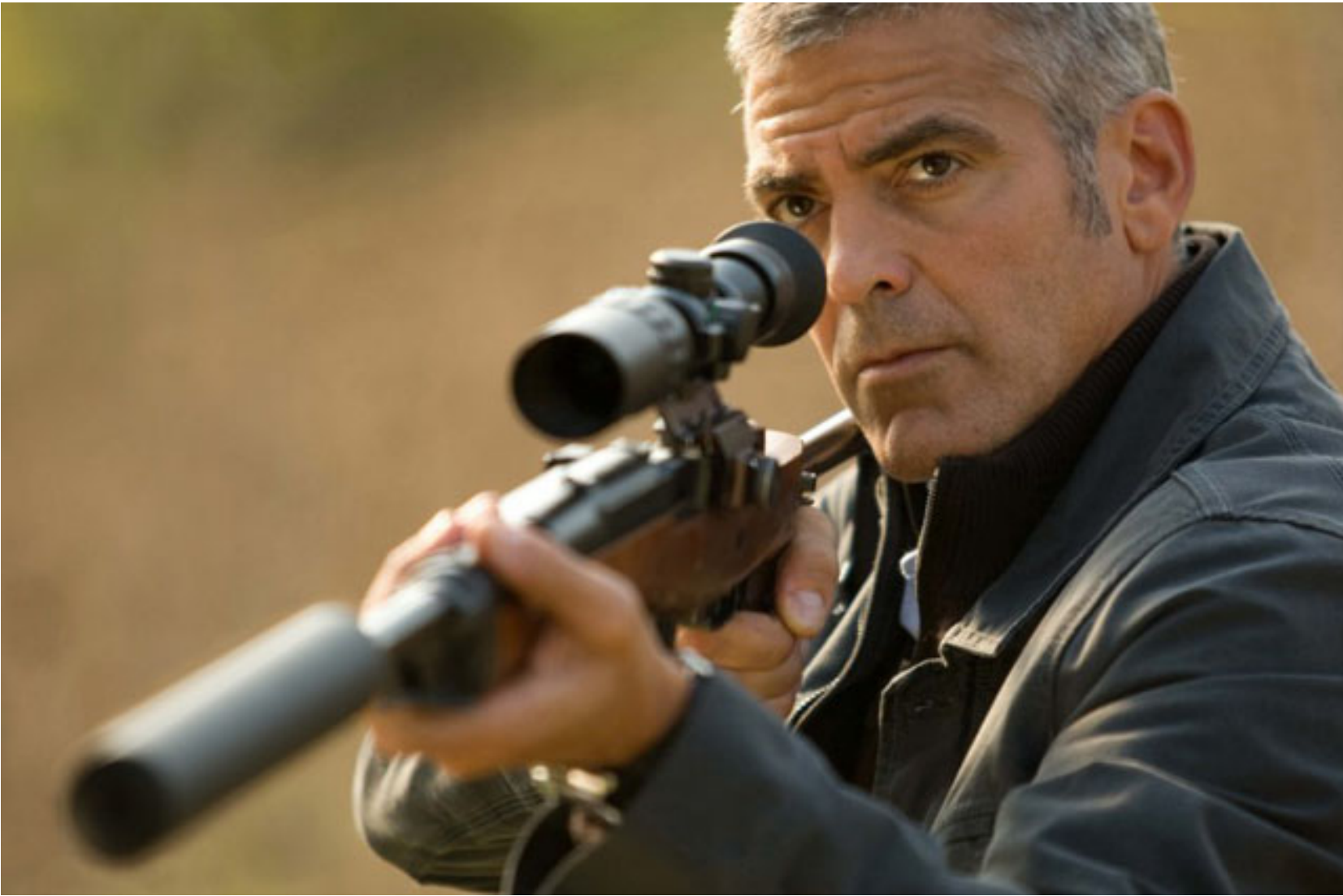
Bang Bang Shoot Shoot: George Clooney as Jack in ‘The American’