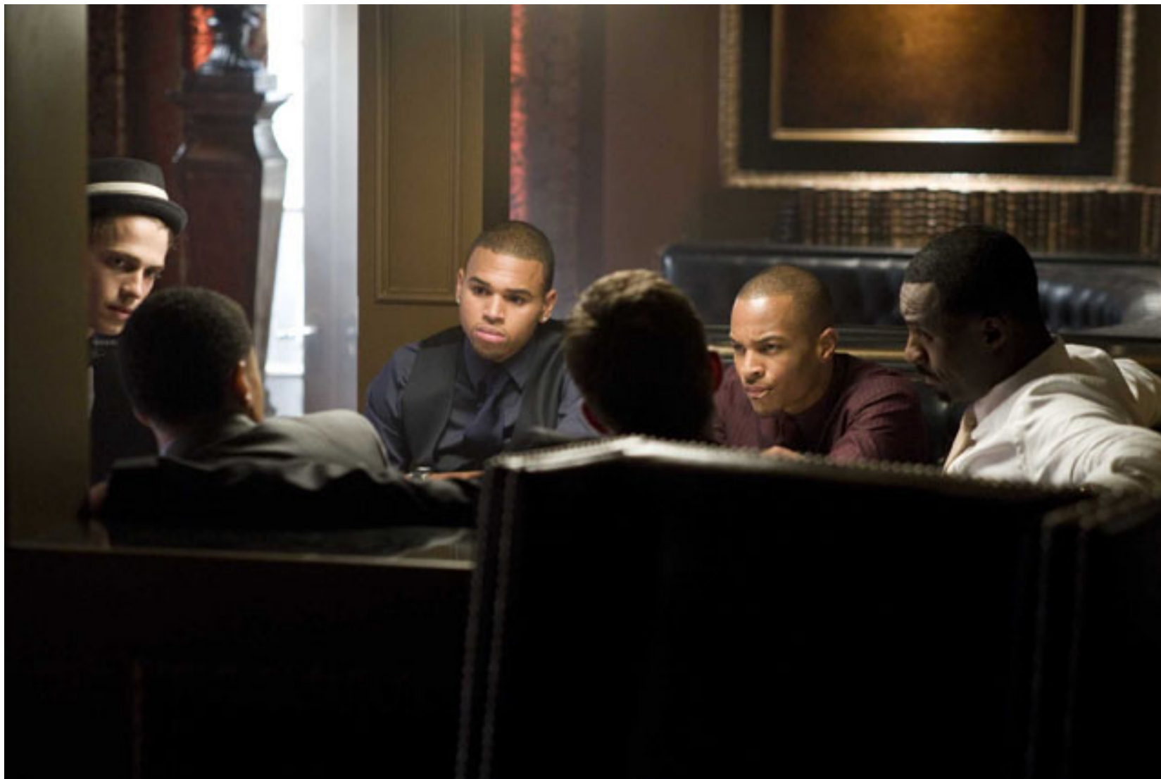
The Gang's All Here: Hayden Christensen, Chris Brown, T.I. and Idris Elba Make the Plan in 'Takers'