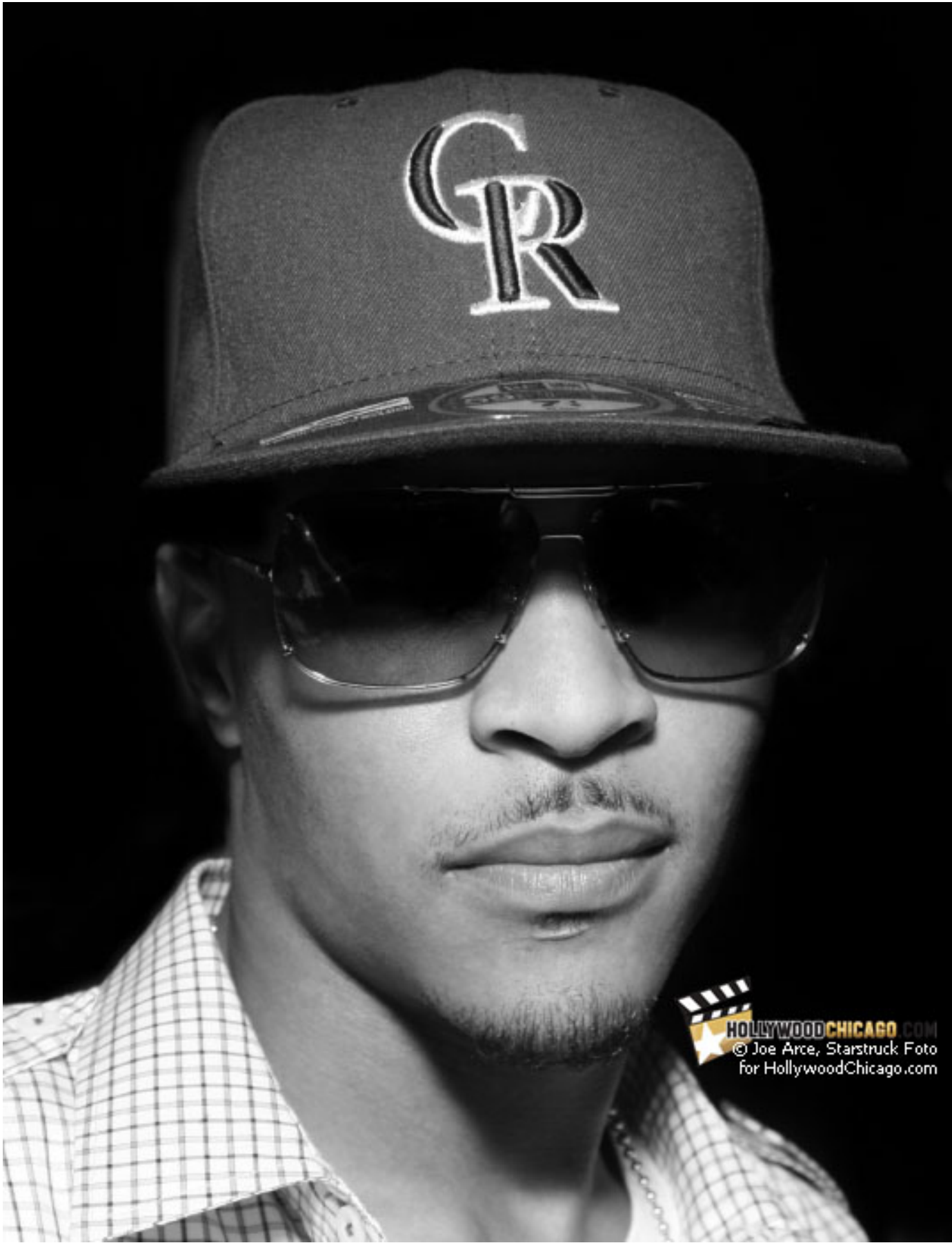
At the 'Tip' of His Career: T.I. at the 'Takers' Chicago premiere, August 10th, 2010

HollywoodChicago.com: What kind of acting style do you most relate to – doing a character instinctively and on-the-fly or making up a whole story for the role so you can relate to the character’s background?