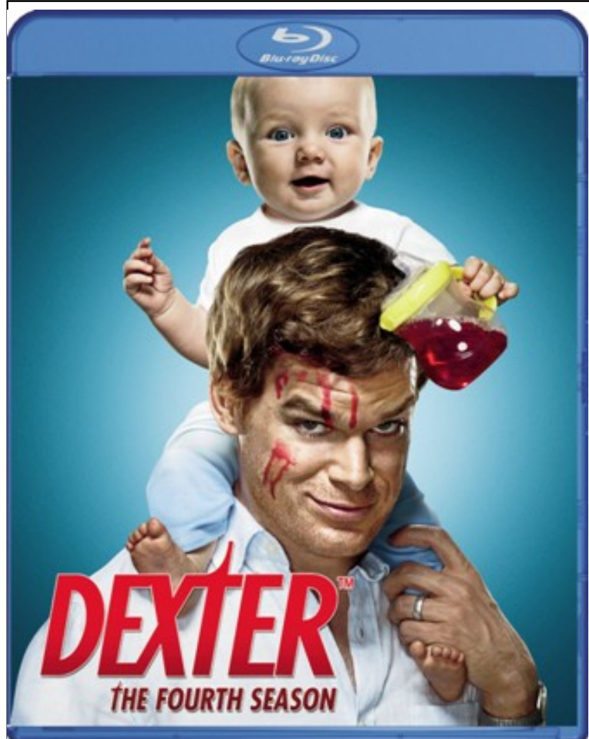
Dexter: The Fourth Season was released on Blu-ray and DVD on August 17th, 2010

Strengthened by one of the best performances of Lithgow's career (a sure Emmy winner for Guest Actor, although one wonders why it wasn't just a traditional Supporting Actor nomination), Trinity is a perfect representation of the duality of Dexter's existence. He too is haunted by a tragic past. He too lives with a wife and children and pretends to be normal. He too needs to kill. But Dexter makes the tragic mistake of thinking that he's significantly better than Trinity and that he could never be like him, but he pays in the end. The final episode of this season is not only stunningly risky from a writing perspective but a game-changer for the show. It will never be the same again.