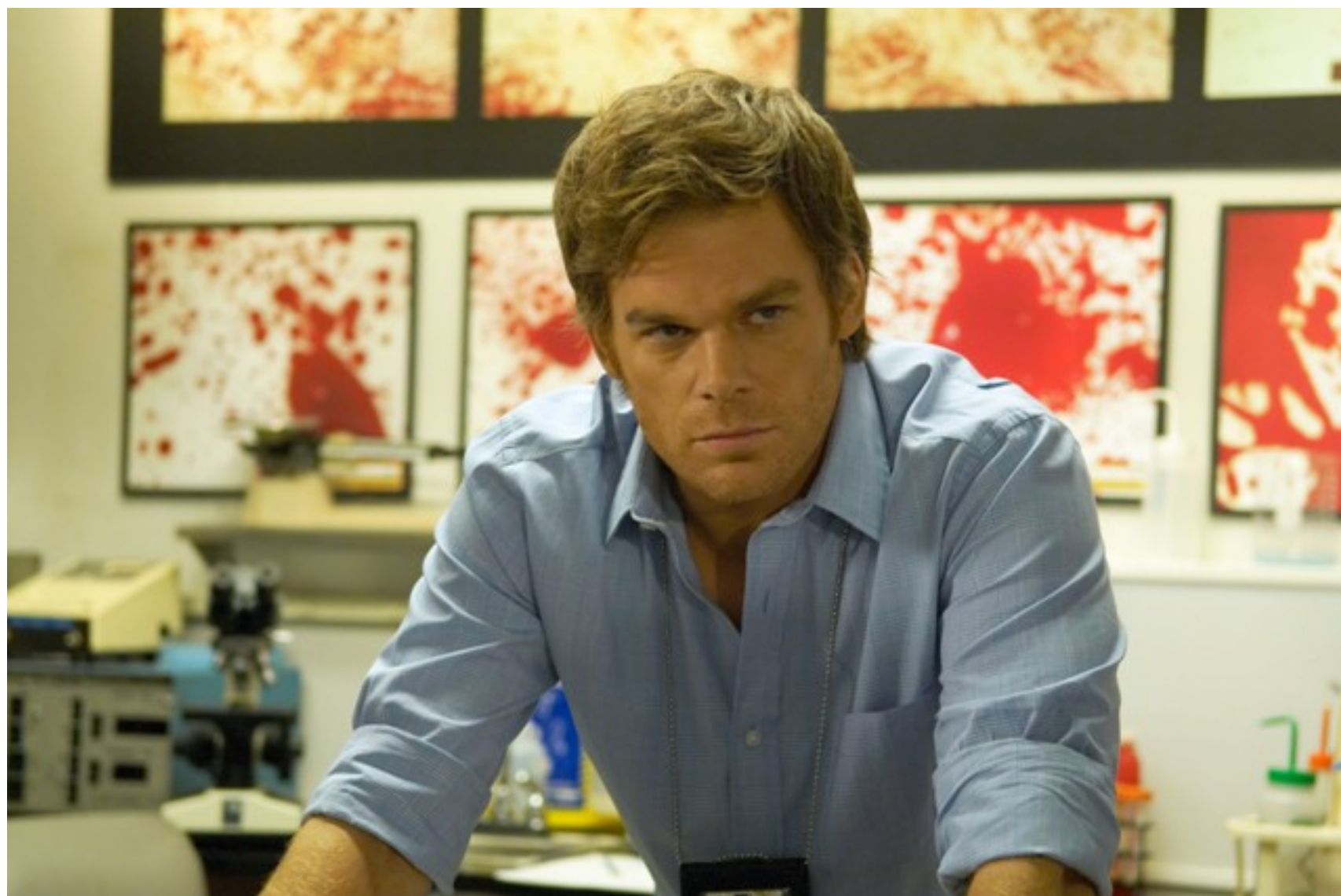
Dexter: The Fourth Season was released on Blu-ray and DVD on August 17th, 2010

The fourth season of “Dexter” features all of the regular actors and guest-star John Lithgow at their absolute peak and the writing was never stronger. The second half of this season, as Dexter Morgan (Michael C. Hall) draws closer to a disturbingly similar serial murderer in the form of The Trinity Killer (Lithgow), is one of the most remarkable string of television episodes in the history of the form. Try and not watch them consecutively. I dare you.