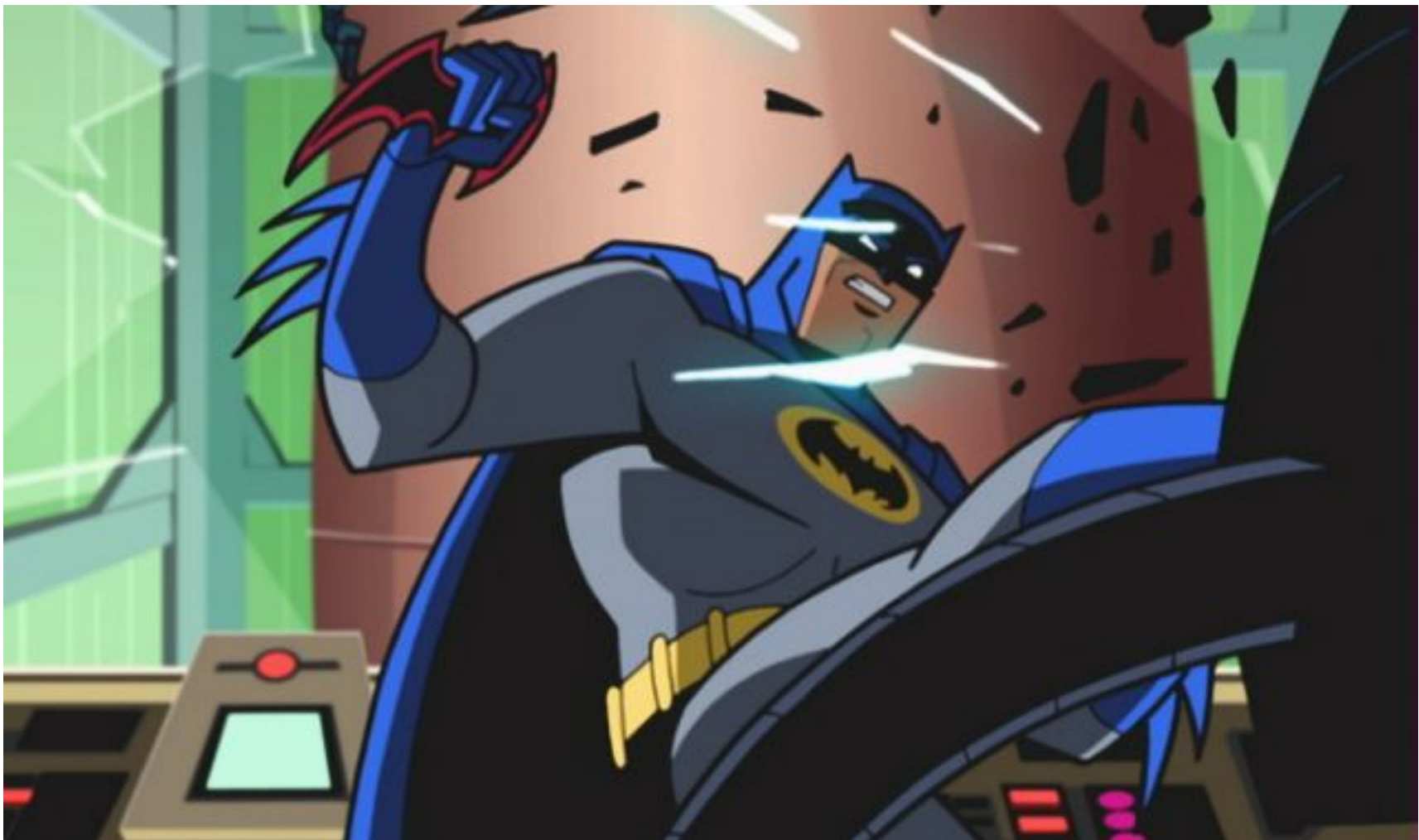
Batman: The Brave and the Bold: Season One, Part One was released on DVD on August 17th, 2010

Kids have it great nowadays. Sure, we had some good cartoons when we were young but the variety and overall quality doesn’t compare to what it’s been over the last decade or so. In the world of superheroes, great programs and movies have arisen from several of the most beloved DC characters including “Justice League,” “Teen Titans,” and a number of great DC Universe films.