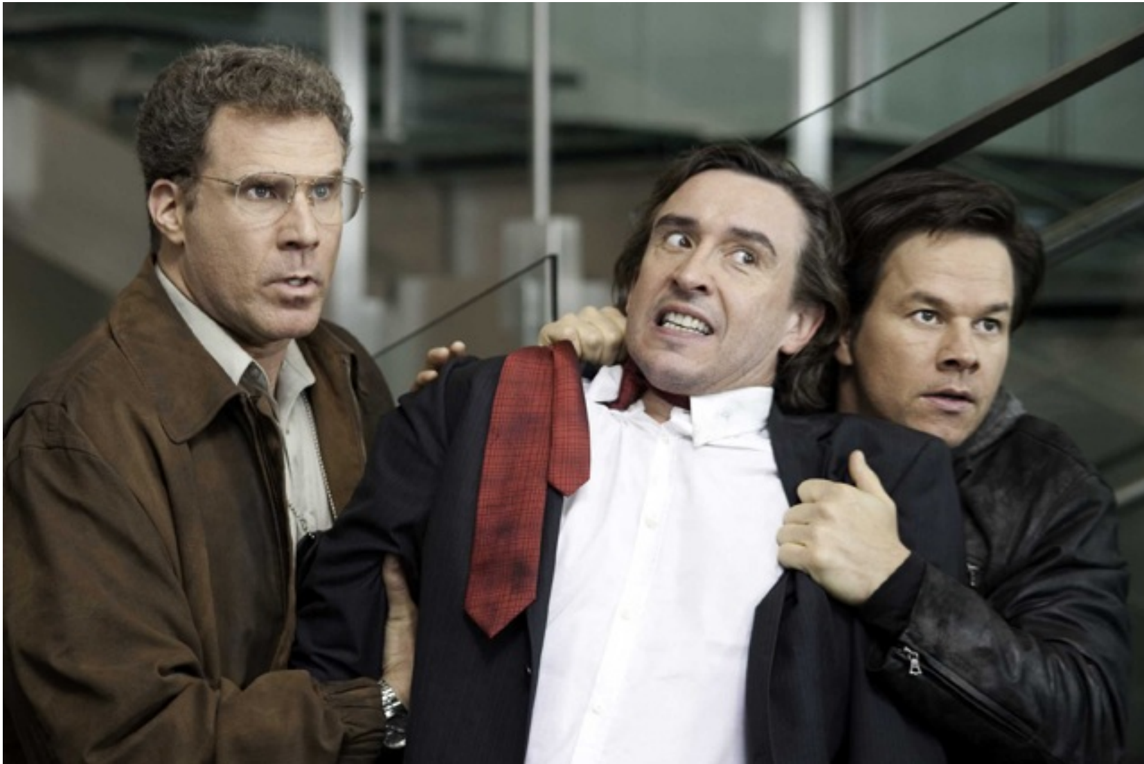
Making the Collar: Will Ferrell as Gamble, Steve Coogan as Erston and Mark Wahlberg as Hoitz in 'The Other Guys'