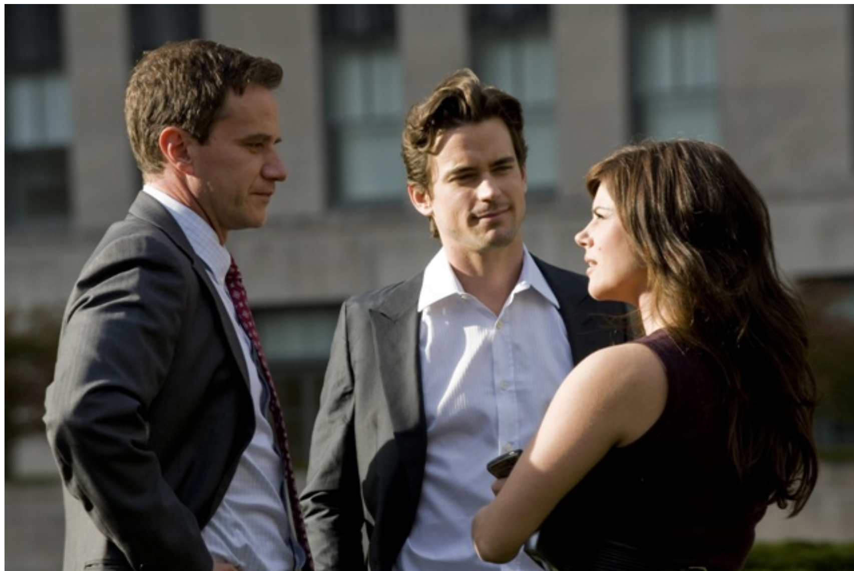
White Collar: Season One was released on Blu-ray and DVD on July 13th, 2010

We've written a lot about the creative streak of the USA network that includes "Burn Notice," "Psych," "In Plain Sight," and the cream of the crop, the incredibly entertaining "Royal Pains." "White Collar" fits squarely in the middle, not breaking any molds or trying anything too daring with its caper-of-the-week format but it is definitely an entertaining program that has developed a loyal following and looks likely to be a consistent performer for the network for years to come. Neal Caffrey and Peter Burke aren't going anywhere any time soon.