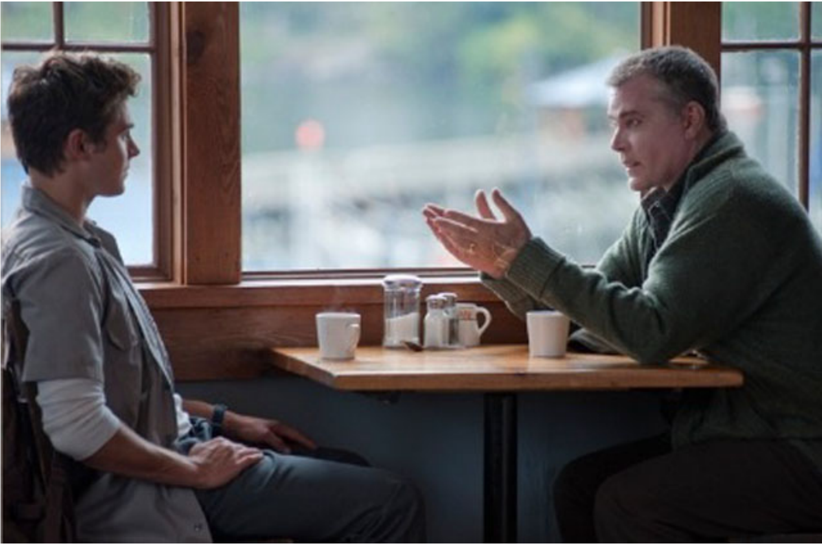
Sage Advice: Zac Efron as Charlie and Ray Liotta as Florio in ‘Charlie St. Cloud’