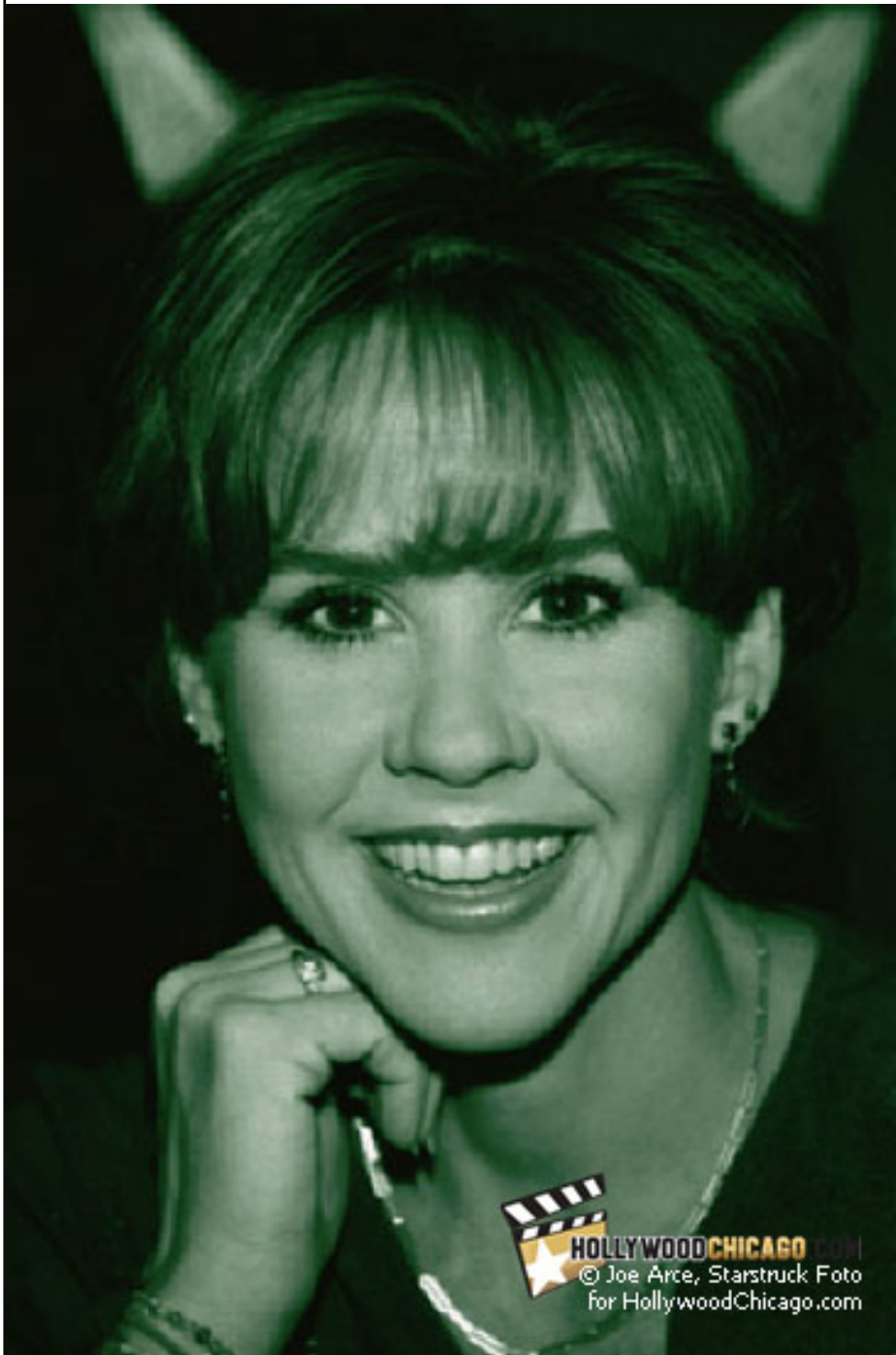
Linda Blair in 1998 at the 25th Anniversary of 'The Exorcist'

It does give me a platform now for the animals. As I got older, and I realized I could make a difference, and I had people out there that I admired like Doris Day, they were the ones shining a light on the animal crisis. It's my turn to step up to the plate because the animals need all of us.