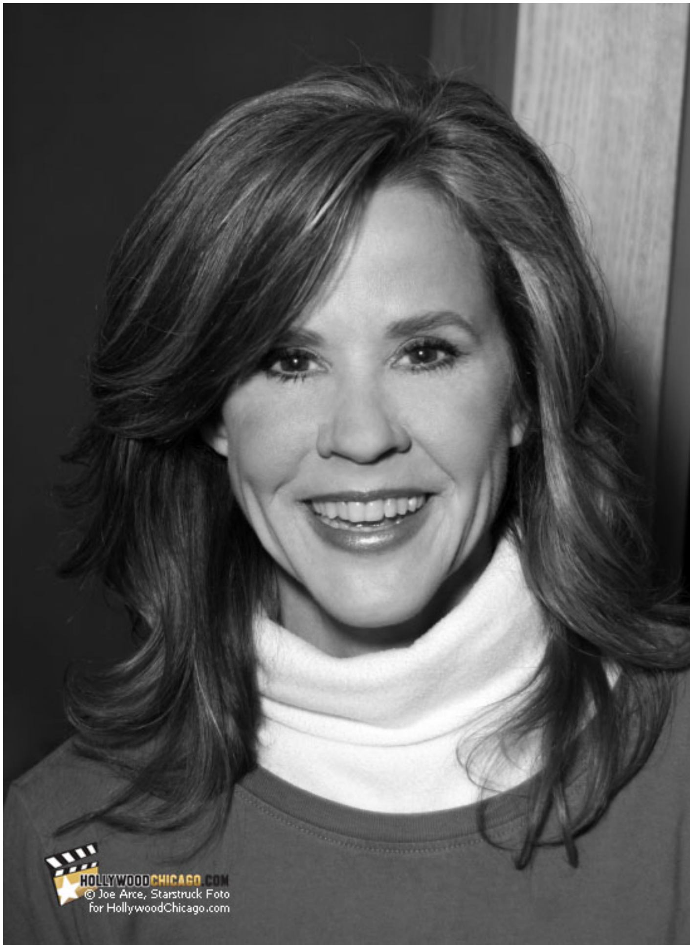
Linda Blair Today: In Chicago at the Hollywood Celebrities & Memorabilia Show, March 13th, 2010