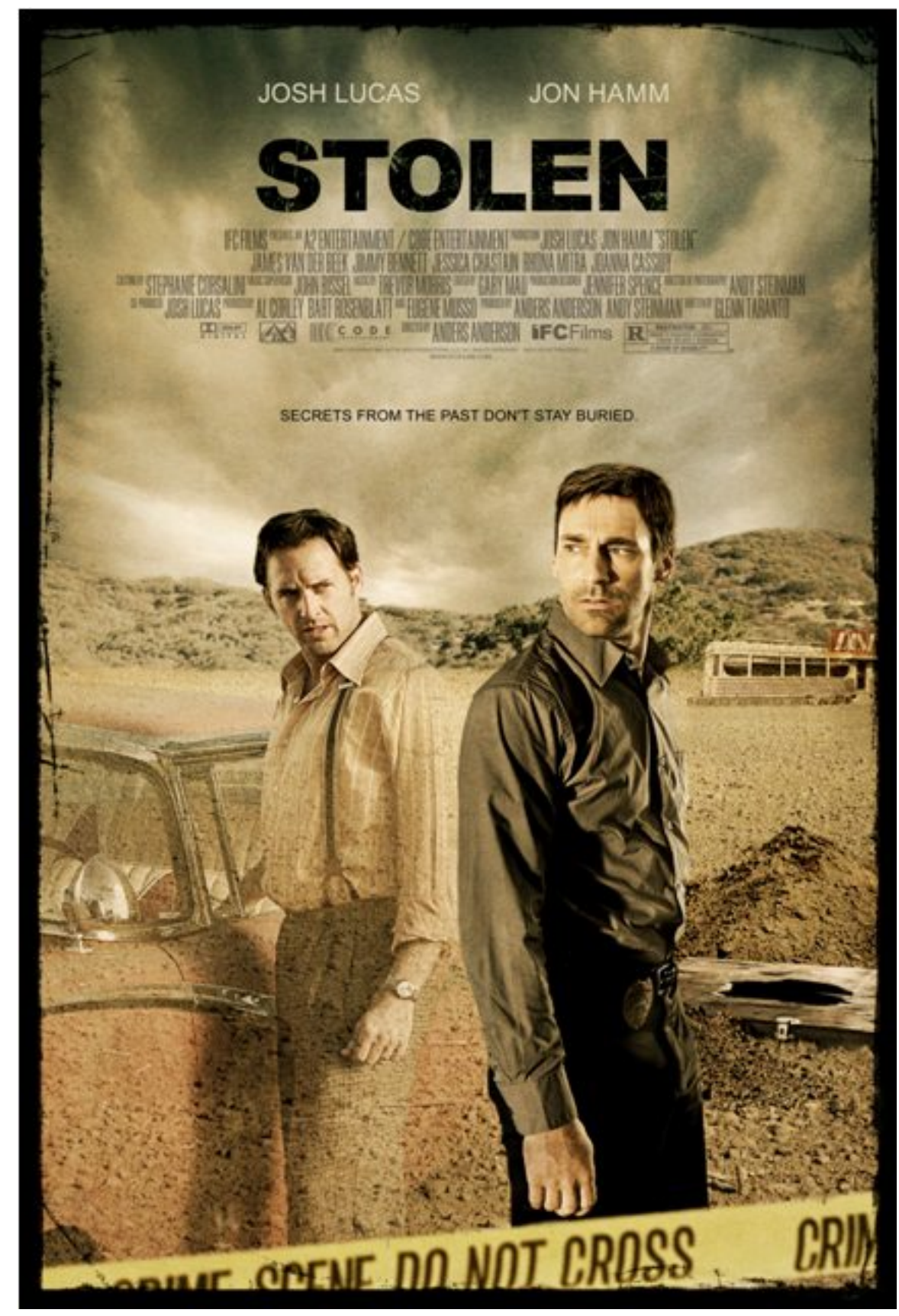
Stolen was released on Blu-ray and DVD on June 29th, 2010

Based on a true story, Hamm stars as Detective Tom Adkins, a man haunted by the disappearance of his son eight years earlier. When a body of a boy roughly the same age as Adkins' son surfaces, it starts the Detective on an investigation into a half-century old crime. As he tries to solve the mystery of the boy in the box, "Stolen" flashes back to 1958 and the tale of another father (Lucas) trying to keep his family together but destined to lose his son (Bennett). How is the murder of one son linked to the disappearance of another? Most audiences will have figured it out before all the dots are connected in the final act.