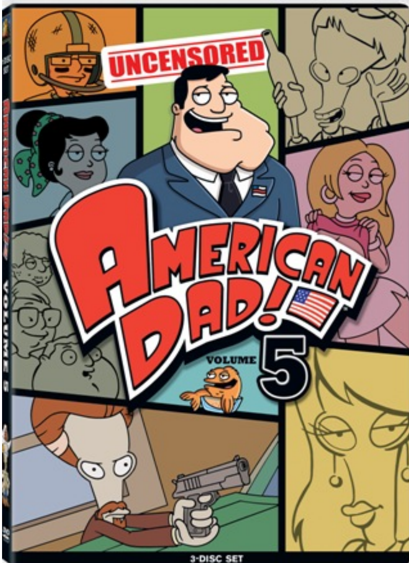
American Dad: Volume Five was released on DVD on June 15th, 2010