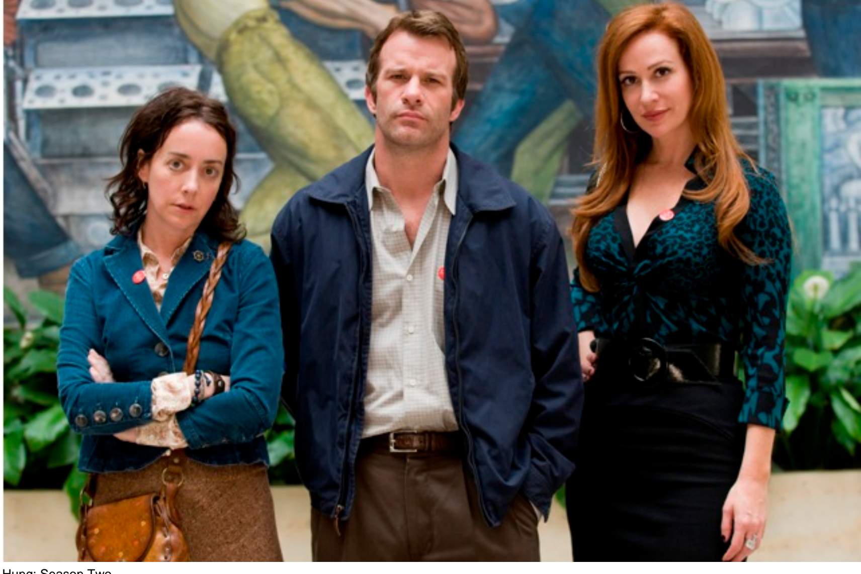
Hung: Season Two

"Hung" always shared thematic ties with Showtime's hit "Weeds" in that both series are about average suburbanites dealing with illegal activities more commonly reserved for the cities. The premiere of season feels even more like the adventures of Nancy Botwin when Tanya goes to the seedy side of Detroit to ask some real hookers for business advice and meets a pimp (the great Lennie James) reluctantly willing to help. "I've got problems...pimp-type problems."