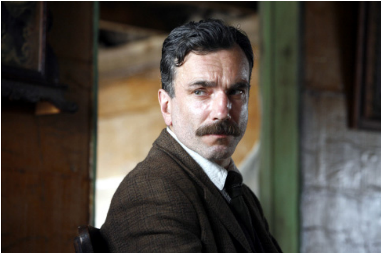
Daniel Day-Lewis in “There Will Be Blood”.