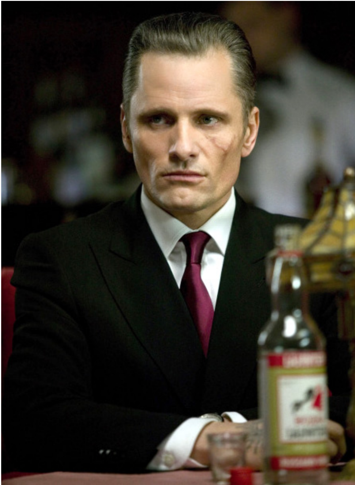
Viggo Mortensen in “Eastern Promises”.