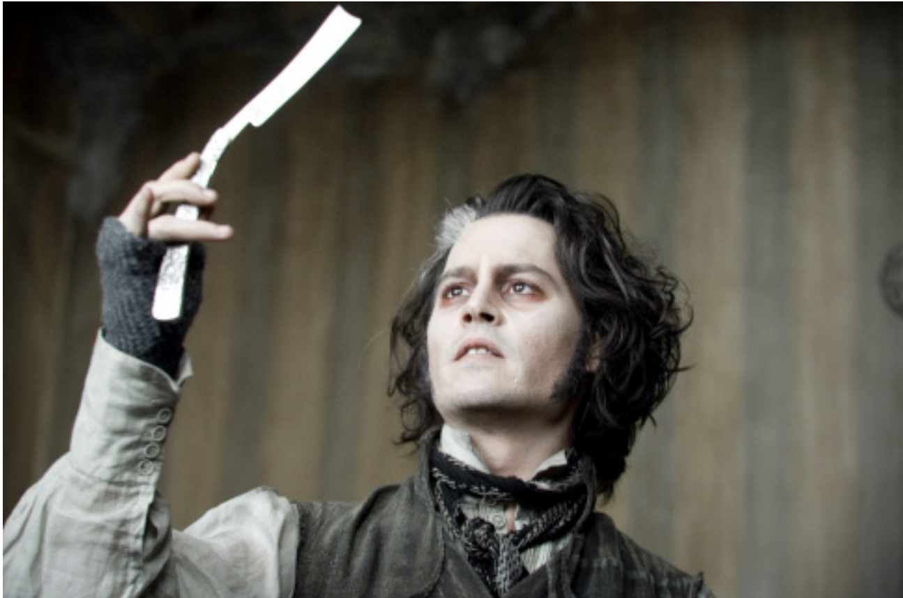
Johnny Depp in “Sweeney Todd: The Demon Barber of Fleet Street”.