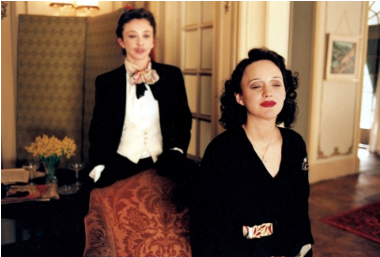
Marion Cotillard in "La Vie en Rose".