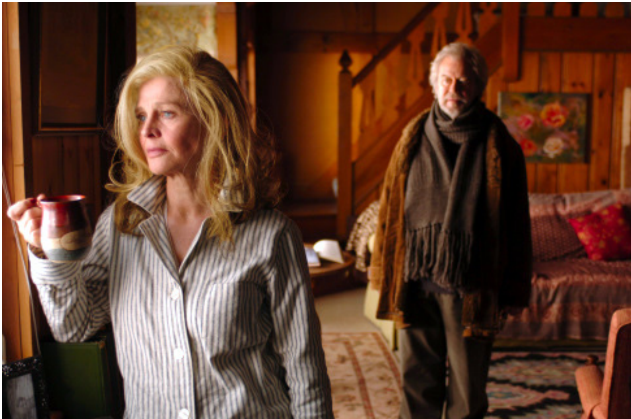
Julie Christie in “Away From Her”.