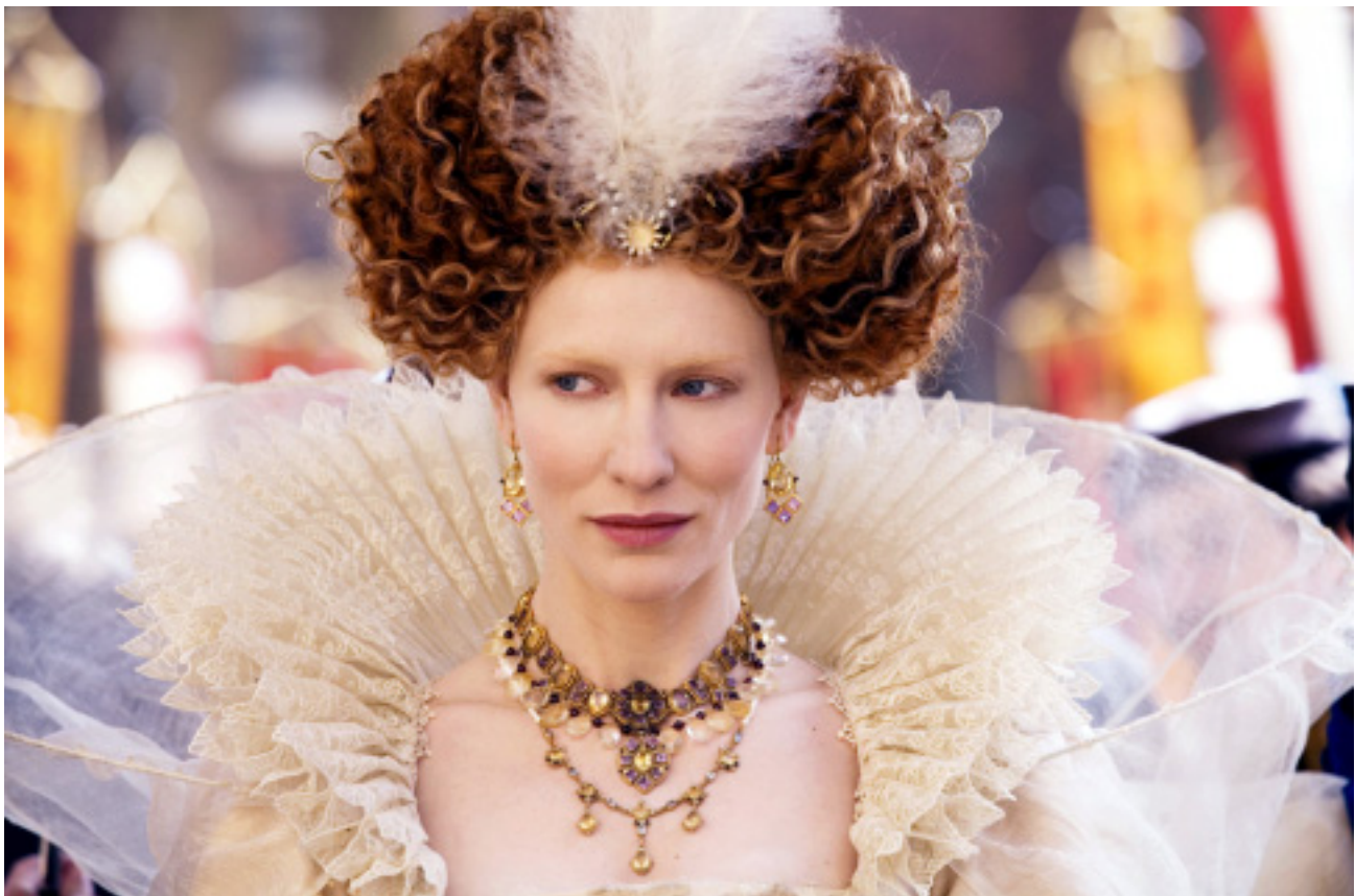
Cate Blanchett in “Elizabeth: The Golden Age”.