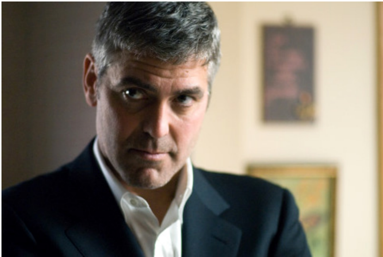
George Clooney in “Michael Clayton”.