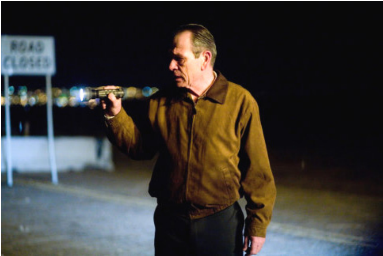
Tommy Lee Jones in the film "In the Valley of Elah".