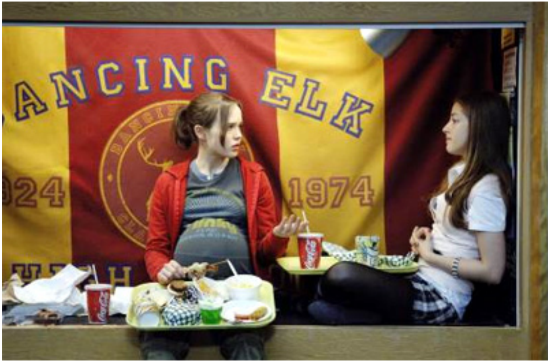
Ellen Page in "Juno".

Discuss this on our discussion boards here! [16]