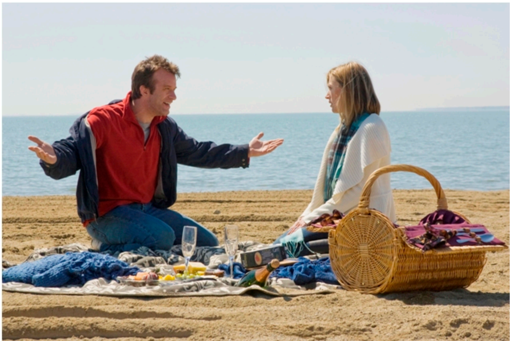
Mary and Max was released on Blu-ray and DVD on June 15th, 2010

The series premiere of “Hung” and even the next few episodes were missing that spark; the chemistry that elevates an experience from being just another one-night stand. The tale of a man (Thomas Jane) who lost everything in the horrible economy but maintained the rights to his giant pecker and how to use it was a hit-and-miss affair that too often missed for at least three episodes. Then the casting agent found the perfect supporting actress and gave her an excellent subplot and “Hung” finally started to find its rhythm. The ups started to outweigh the downs and there’s reason to believe that “Hung” could someday stand with the best comedies of the network.