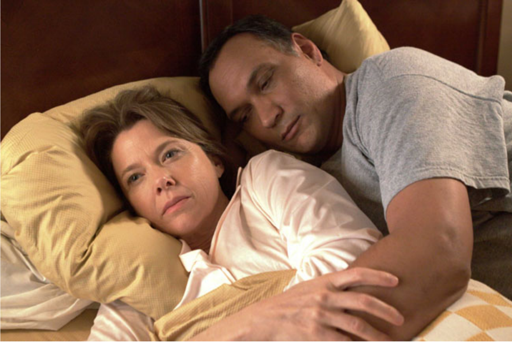
Renewal: Annette Bening as Karen and Jimmy Smits as Paco in 'Mother and Child'