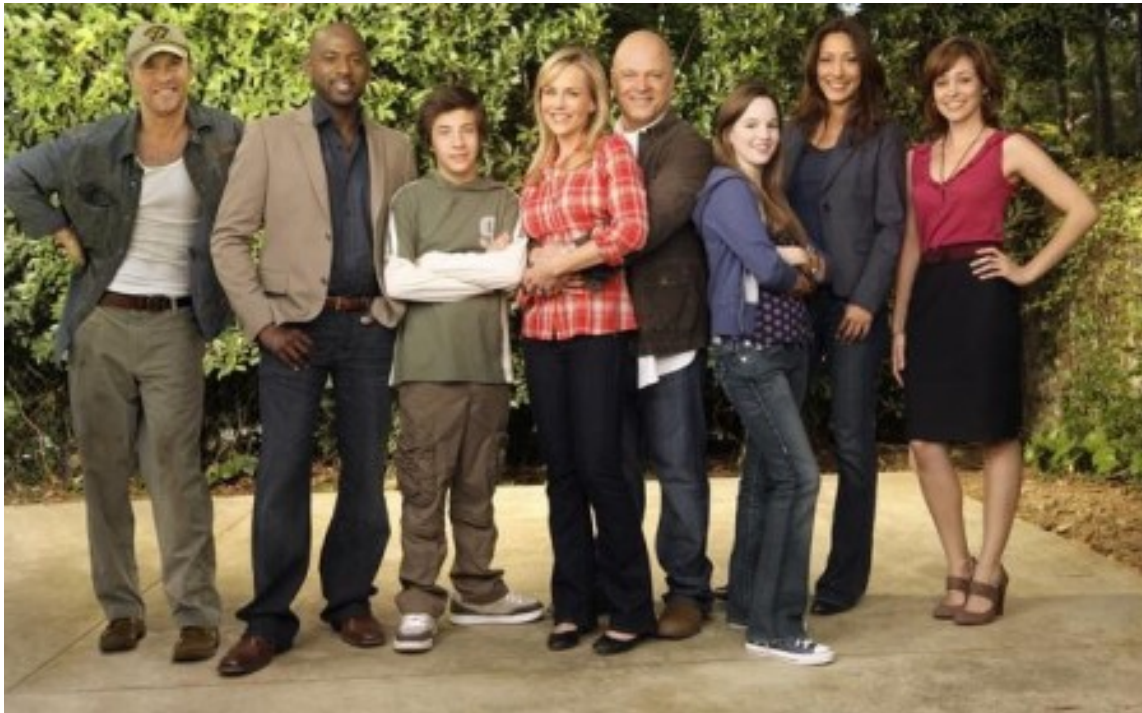
No Ordinary Family - Tate Donovan, Romany Malco, Jimmy Bennett, Julie Benz, Michael Chiklis, Kay Panabaker, Christina Chang, Autumn Reeser

The Powells are about to go from ordinary to extraordinary. After 16 years of marriage, Jim and Stephanie's relationship lacked the spark it once had, and their family life now consists of balancing work and their two children; leaving little time for family bonding. During a family vacation set up by Jim in an attempt to reconnect, their plane crashes into the Amazon River. But this is where the fun starts for the Powells as they soon discover that something's not quite right. Each of them now possesses unique and distinct superpowers. But saving and savoring their family life will be equally important as they try to find purpose for their new power and embark on a journey to find out what defines and unifies them. The Powells are a totally relatable family that happens to be a little bit amazing.