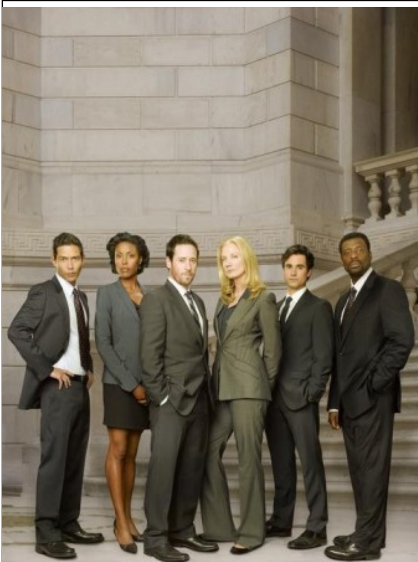
The Whole Truth - Anthony Ruivivar, Christine Adams, Rob Morrow, Joely Richardson, Sean Wing, Eamonn Walker

This unique legal drama chronicles the way a case is built from the perspective of both the defense and prosecution. Showing each side equally keeps the audience guessing, shifting allegiances of guilt or innocence until the very final scene.