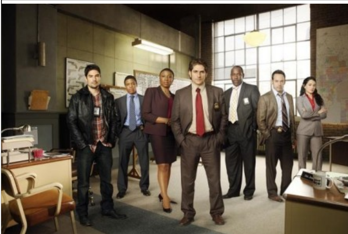
Detroit 1-8-7 - D.J. Cotrona, Jon Michael Hill, Aisha Hinds, Michael Imperioli, James Mcdaniel, Shaun Majumder, Natalie Martinez