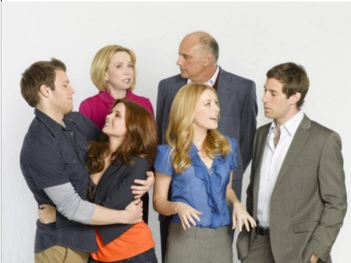
Better Together - Jake Lacy, Joanna Garcia, Debra Jo Rupp, Jennifer Finnigan, Kurt Fuller, Josh Cooke.