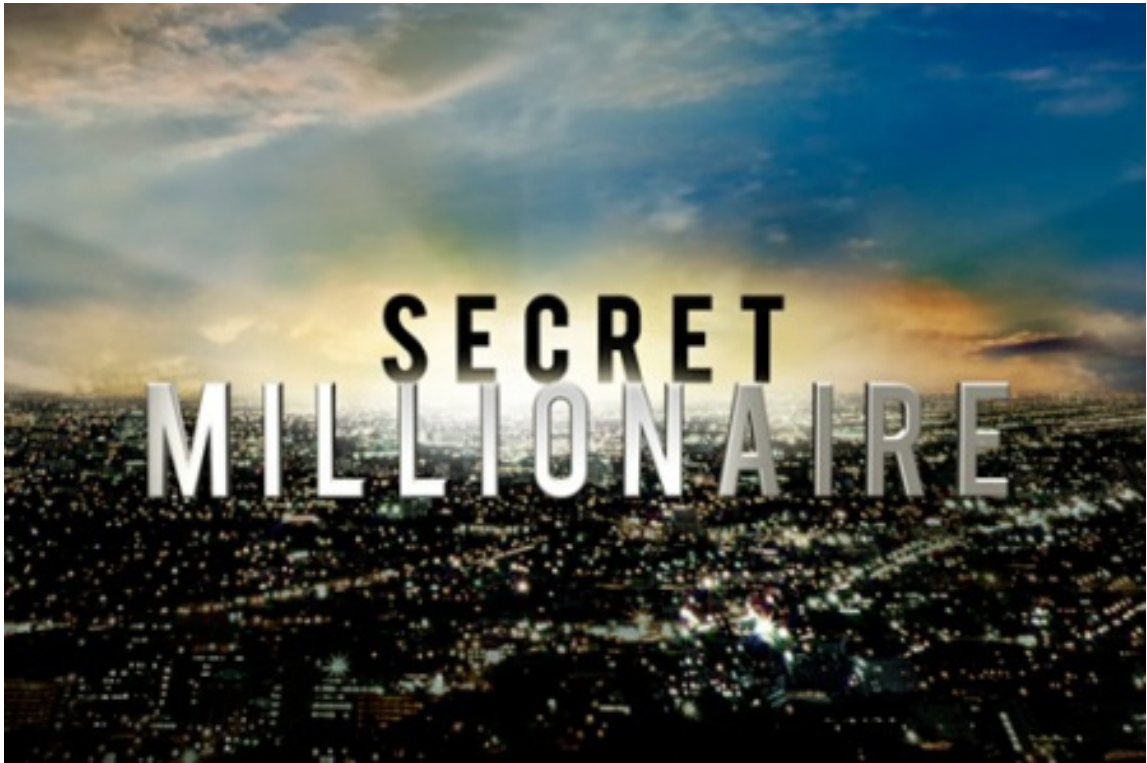
Secret Millionaire.

“Secret Millionaire” is a one-hour alternative series that follows some of America’s wealthiest people for one week as they leave behind their lavish lifestyles, sprawling mansions and luxury jets, conceal their true identities, and go to live and volunteer in some of the most impoverished and dangerous communities in America. Surviving on welfare wages, their mission is to discover the unsung heroes of America - deserving individuals who continually sacrifice everything to help those in need. Throughout this incredible experience, the Secret Millionaires will attempt to remain undiscovered, coming face to face with extraordinary and amazing people battling the odds every day of their lives. On the final day, in an emotional and dramatic climax, they reveal their true identities. Ultimately, the millionaires will each give away at least $100,000 of their own money, changing lives forever.