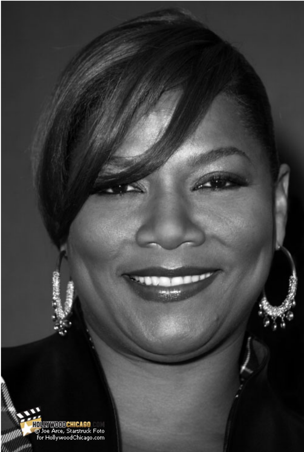
Common's Co-Star Queen Latifah During an Appearance at Macy's in Chicago for Her New Fragrance, 'Queen,' November 28, 2009