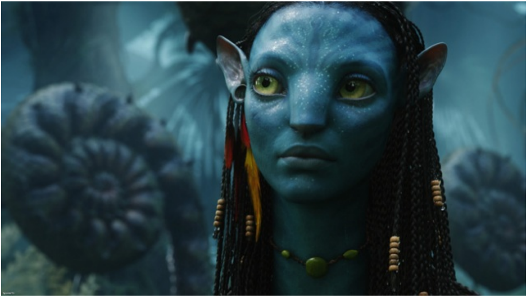
Avatar was released on DVD and Blu-Ray on April 22nd, 2010.

Director James Cameron recently boasted of his satisfaction that “Avatar” made it to Blu-ray/DVD with no trailers piggybacking on the film and even a limited menu. He liked the idea that the viewer was dumped right back into the world of Pandora and there is something to be said for streamlining an experience that can often get bloated with previews, clips, and, most bizarrely, advertisements for the Blu-ray technology that you’re watching.