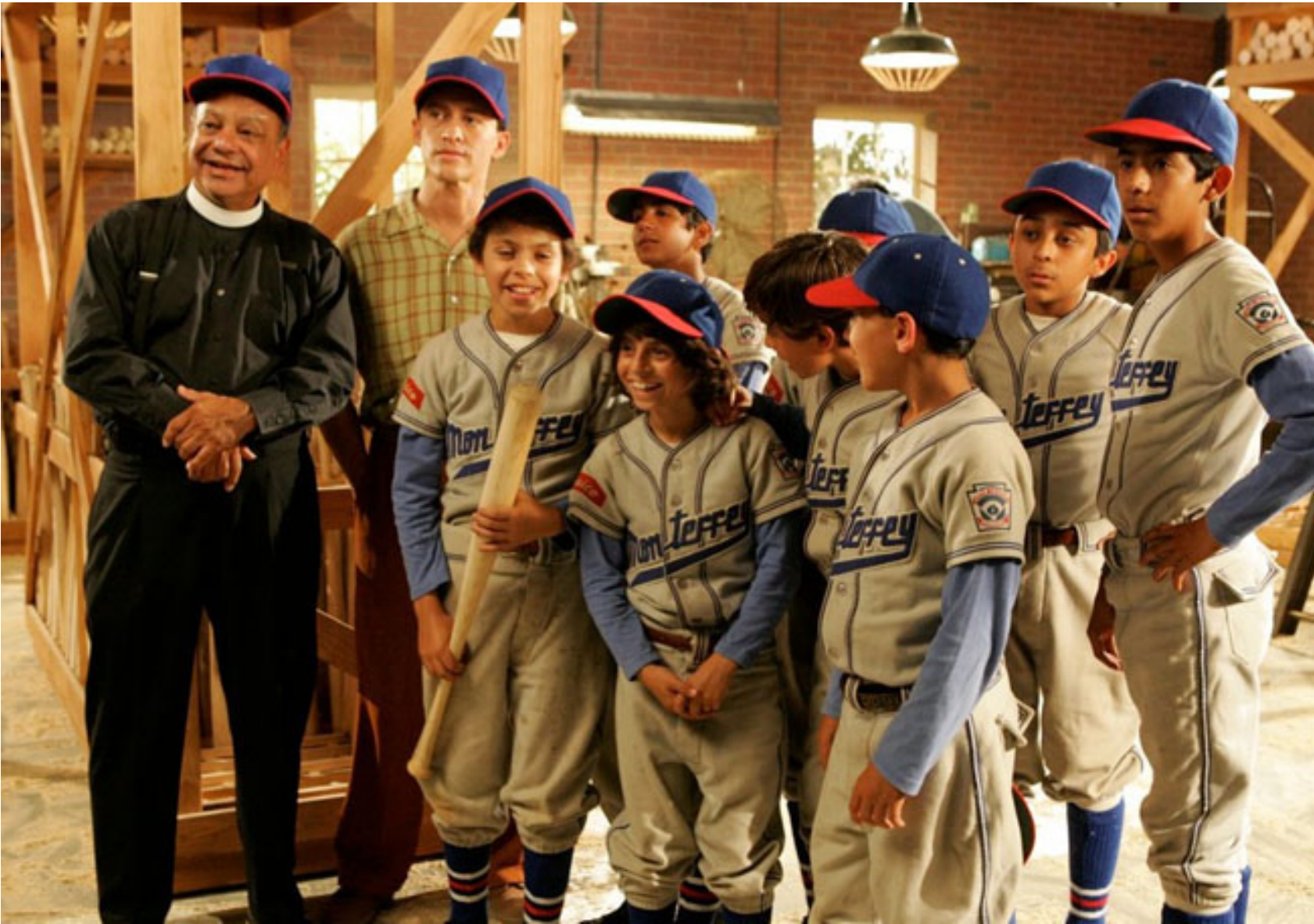
Cheech Marin (left) as Padre Estaban and Clifton Collins Jr. as Coach Cesar with the Little Leaguers of ‘The Perfect Game’