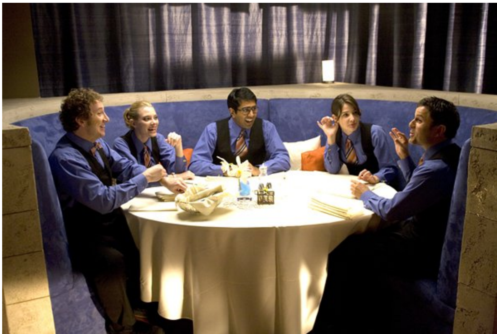
The Slammin' Salmon was released on DVD and Blu-Ray on April 13th, 2010.

Barely released in theaters at the end of last year, “The Slammin’ Salmon” was swept under the rug and will be a straight-to-DVD release for most markets. Having been an admirer of their past work, I was stunned that they couldn’t even get a brief theatrical release for the first Broken Lizard film since 2006. Now I understand. “Salmon” is easily the group’s most ineffective film with only sporadic laughs, the pacing of a sitcom, and some truly awful gross-out humor. Worst of all, it’s completely forgettable.