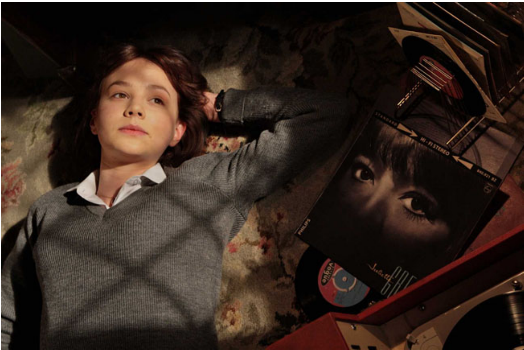
An Education was released on Blu-ray and DVD on March 30th, 2010.