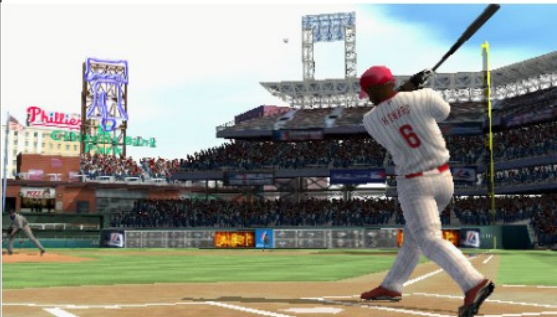
MLB 10: The Show

It may look great, but how does it play? The smooth animation of the PS3 version and incredibly in-depth pitcher/batter mechanics are a little less refined but that's to be expected. There are, however, a few elements of the gameplay that are unacceptable including a lack of urgency on throws to the cut off man (a problem in the PS3 version but it feels even more pronounced in this one) when you're trying to make a play at home and some odd baserunning A.I. that allows for too many players to be picked off or just make dumb decisions.