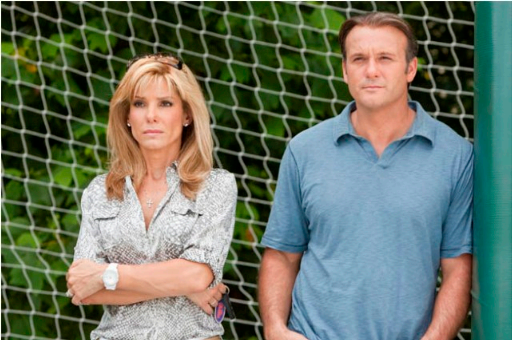
The Blind Side will be released on DVD and Blu-ray on March 23rd, 2010..

We’ll get to the Blu-ray details but we should discuss the quality of the film itself. Unlike a lot of critic friends, I can see the charm of “The Blind Side”. It’s an old-fashioned crowd-pleaser that allows people to feel good about their fellow man. Yes, there may be difficult sections of the country, but we can all sleep better at night knowing there are people like Leigh Anne Tuohy out there to save the day.