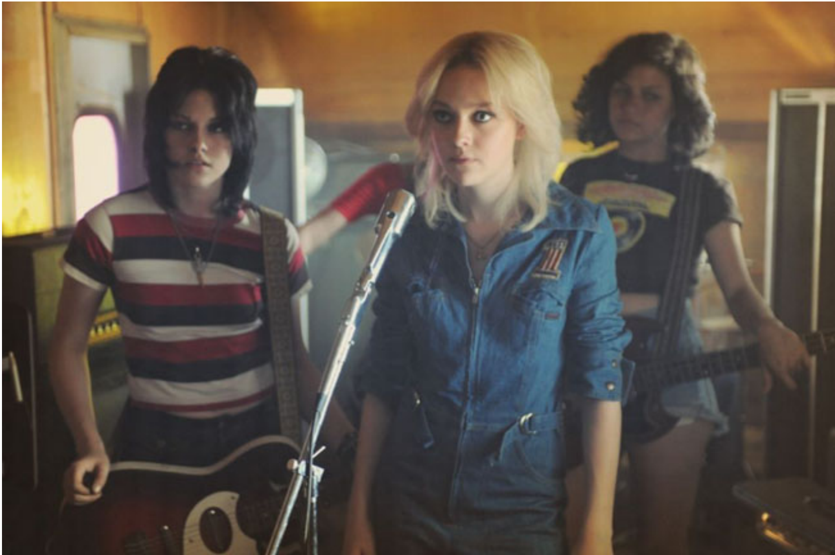
I Love Rock & Roll: Kristen Stewart as Joan Jett, Dakota Fanning as Cherie and Alia Shawkat as Robin in ‘The Runaways’