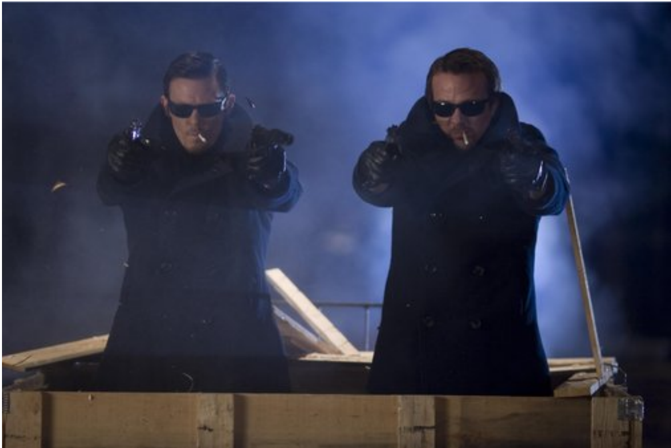
Boondock Saints II: All Saints Day was released on Blu-ray and DVD on March 9th, 2010.

The relatively simple script for “Boondock Saints” was one of the main reasons it worked. The Tarantino-esque structure of a lawman (Willem Dafoe) retracing the steps of two vigilante killers largely through slow-motion flashback wasn’t perfect but it was fun and structurally clever.