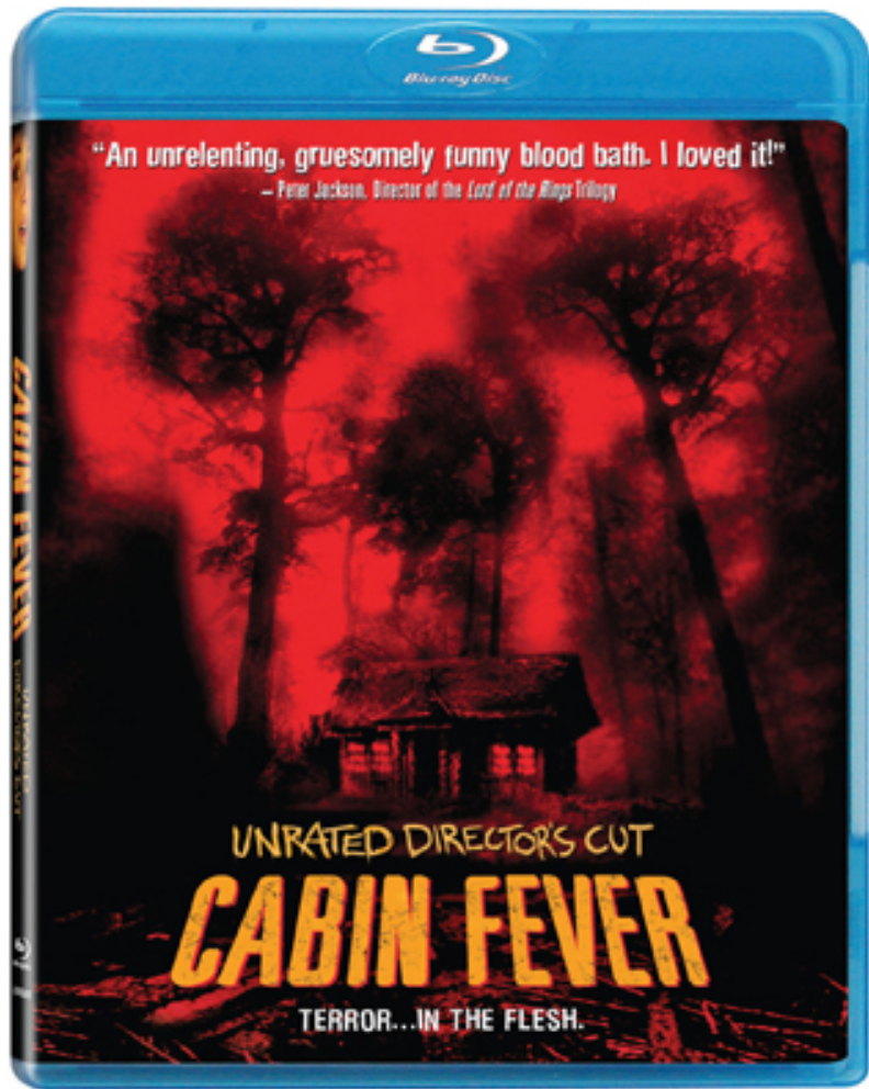
Cabin Fever was released on Blu-ray on February 16th, 2010.

The Blu-ray release of "Cabin Fever" looks pretty good - it should tell you something about what Lionsgate thinks of "Cabin Fever 2" that only the original is being offered in HD - and sounds even better. For the record, "Cabin Fever 2" looks absolutely awful with one of the laziest transfers I've ever seen and audio mix that never sounds right. It's a movie the studio wants to forget (and the director wants nothing to do with) slapped on to a standard DVD. I've seen burned home movies that looked and sounded better.