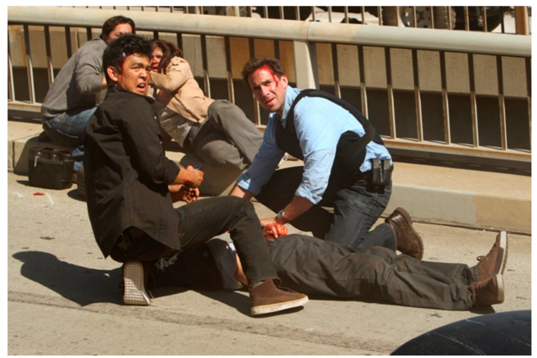
FlashForward: Season One, Part One was released on DVD on February 23rd, 2010.

In case you're completely unfamiliar, "FlashForward" opens with a disaster. A man crawls from a crashed car to hear screaming and see that a horrible disaster has happened. We flash back just a bit and get to that moment again, where it turns out that the entire world has blacked out for 137 seconds and seen a glimpse of sixth months into the future (which just happens to coincide with the beginning of sweeps...clever.)