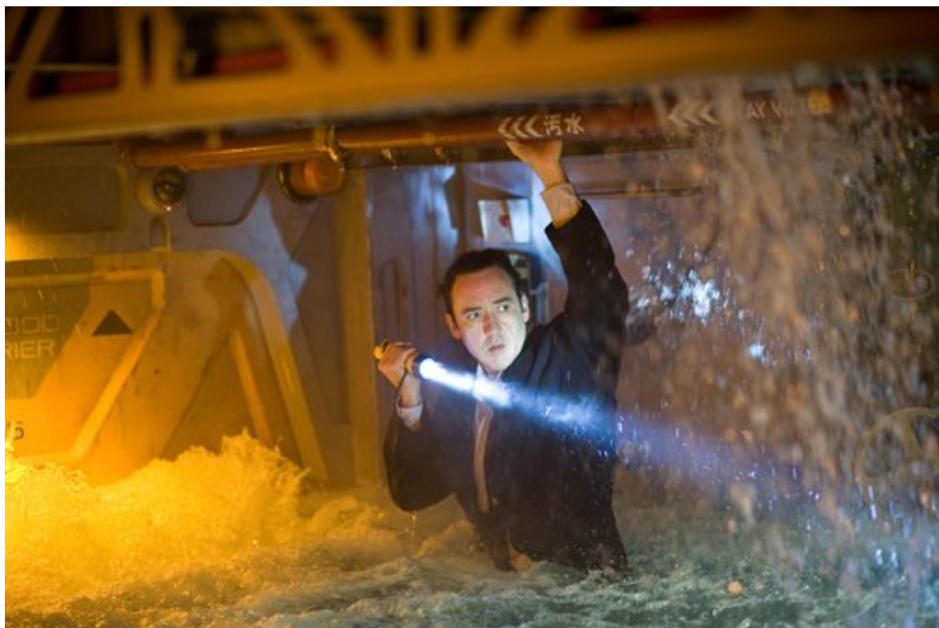
John Cusack stars in Roland Emmerich's 2012.

If Emmerich had chosen to make this picture instead of "Independence Day" back in the late 90s, the title would've been "Y2K." "2012" is easily Emmerich's most entertaining effort since his "man versus alien" adventure, and that's largely because they follow the same basic structure. Both films run about two-and-a-half hours, the first of which is devoted to a Spielbergian building of dread and an eventual race from destruction. The second hour is mostly tearful goodbyes and reunions, leading to a final act of feel-good fist-pumping. Yet while "ID4" coasted on the charisma of its two vibrant leads, Will Smith and Jeff Goldblum, "2012" aims for a bigger dramatic punch, eliciting subtler work from stars John Cusack (whose dry detachment fits the thin material like a charm) and Chiwetel Ejiofor (exuding Sidney Poitier-like honor). Yet the inherent silliness of the subject matter diffuses any possible dramatic momentum. Emmerich still thinks the life of a dog is worth more than countless human extras.