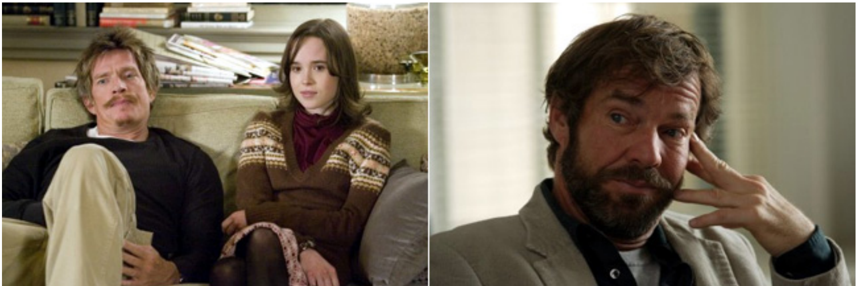
Left production still: Thomas Haden Church and Ellen Page in “Smart People”. Right production still: Dennis Quaid in “Smart People”.

Winners will be contacted via e-mail with exclusive codes for digital movie passes along with the time and location information for this special screening. “Smart People,” by the way, is about a widowed professor finding a new love and grappling with an unexpected visit from his adopted brother. Good luck!