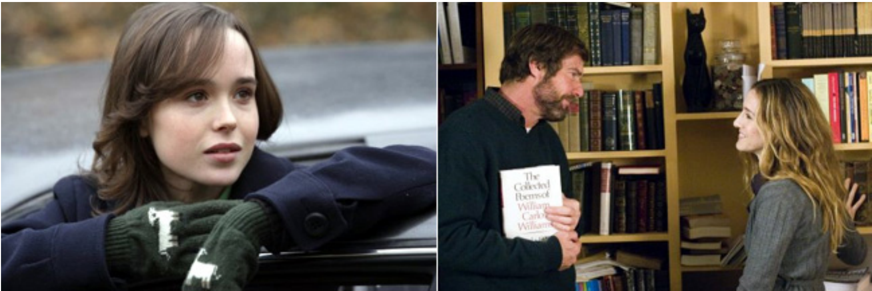
Left production still: Ellen page in “Smart People”. Right production still: Dennis Quaid and Sarah Jessica Parker in “Smart People”.

While the film opens wide on April 11, 2008, the Chicago screening for this film is on April 10, 2008 . In order to win your pair of tickets, all you need to do is remember what you learned in fifth grade. In the same vein as the TV show “Are You Smarter Than a 5th Grader” on FOX, we have five easy-peasy questions below ( source [2]) for you to answer.