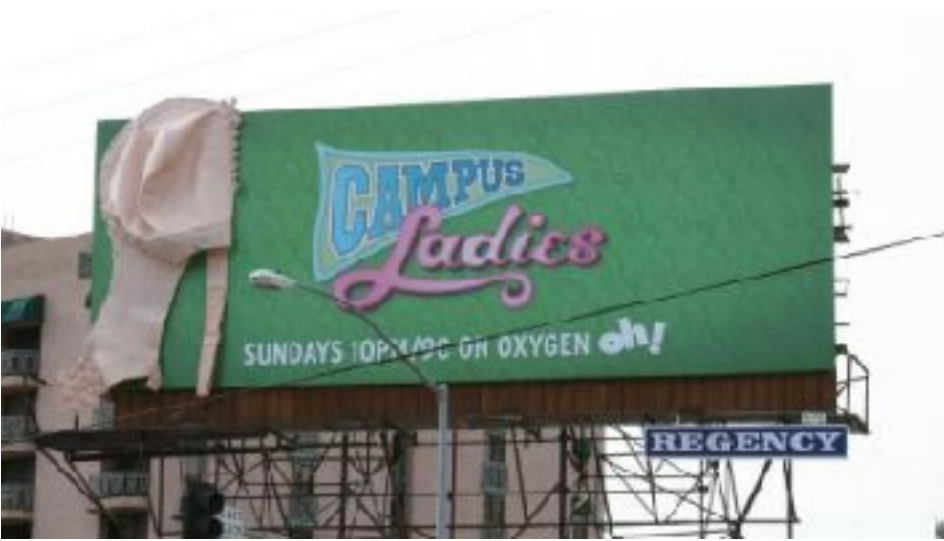
A "Campus Ladies" billboard.