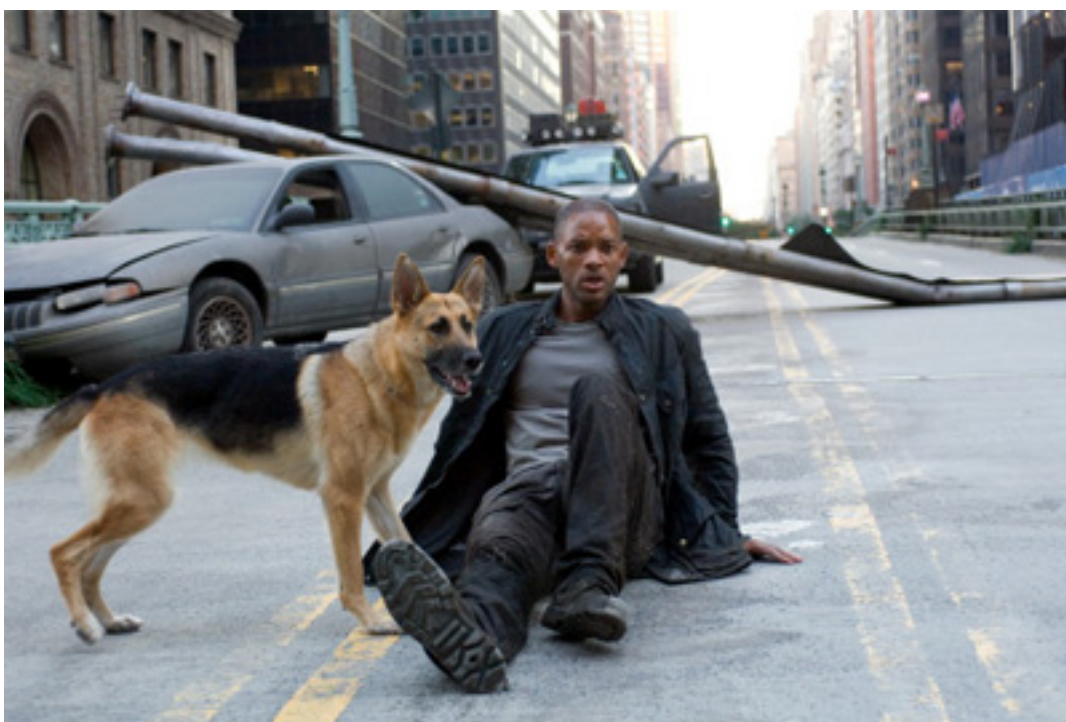
Will Smith in “I Am Legend”.

Each item will have a relationship with the film and can be used to earn autographed posters, novels, gear and get you one step closer to winning tickets and a hotel stay in New York for the premiere of the film on Dec. 11.