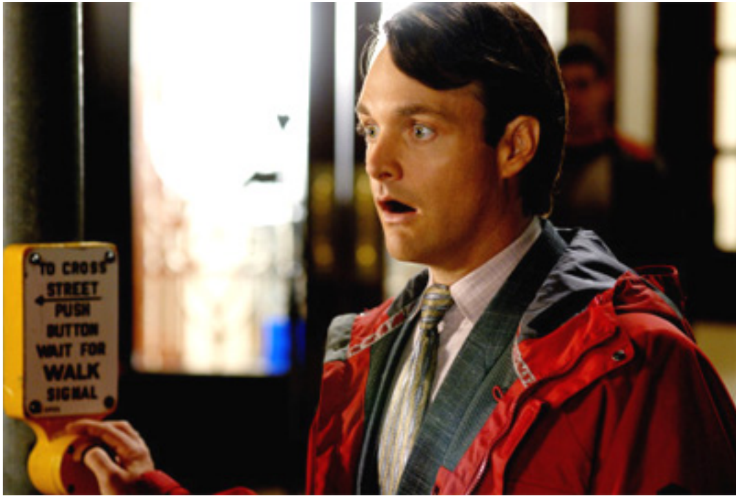
Will Forte in "The Brothers Solomon".