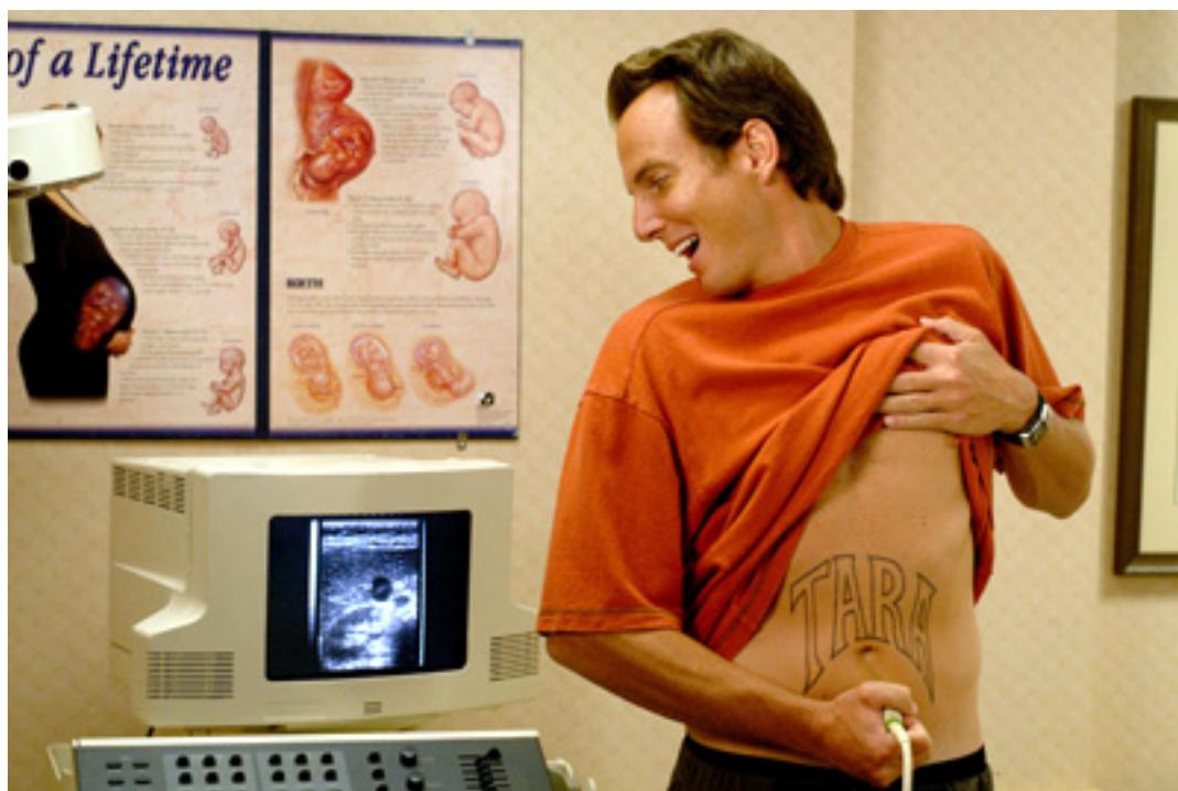
Will Arnett in “The Brothers Solomon”.

CHICAGO – With 2007 films like “Knocked Up” and “Superbad,” the smart and embarrassingly truthful geek comedies are the current wave of humor in America.