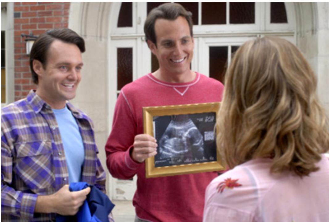
Will Forte (left) and Will Arnett in "The Brothers Solomon".

In a recent interview [14] on the "Sound of Young America," Odenkirk claimed that while he was disappointed with his final product of last year's bomb ("Let's Go to Prison"), "The Brothers Solomon" is hilariously redeeming.